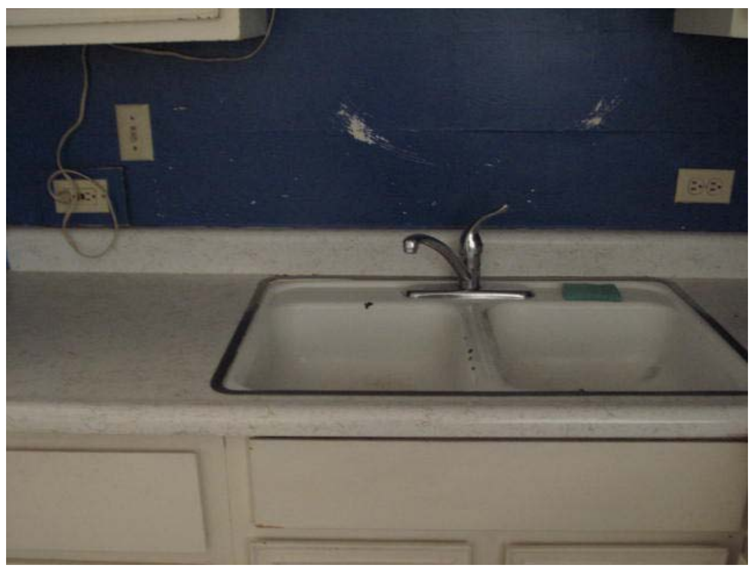
Existing Kitchen Counter and Sink