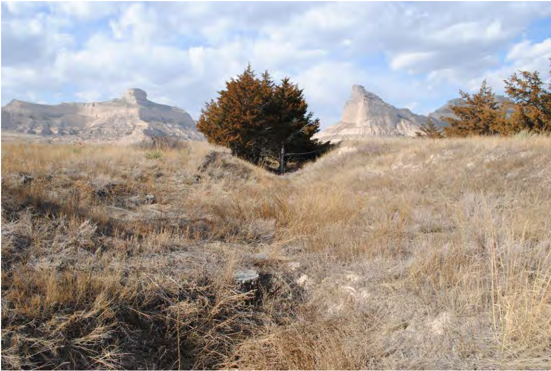
Figure 3 - 40. Unidentified ruts with Scotts Bluff and South Bluff (in background) in Character Area C (2009) (MBD DSC_0046.JPG)