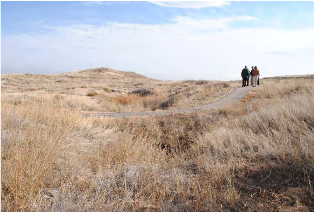
Figure 3 - 43. Asphalt bike trail in Character Area C looking east (2009) (MBD DSC_0061.JPG)