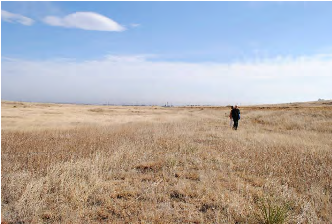
Figure 3 - 42. North side of county road Old Oregon Trail looking east in Character Area C (2009) (MBD DSC_0061.JPG)