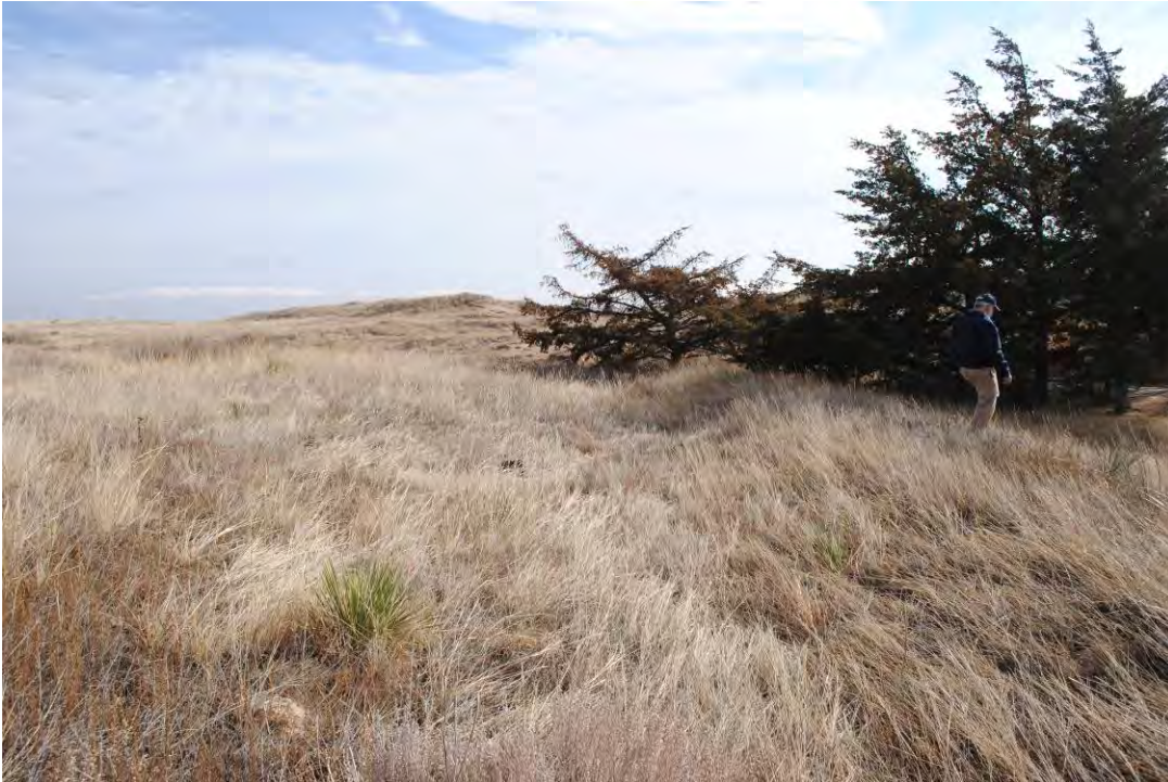
Figure 3 - 39. Unidentified ruts with eastern red cedar plantings in Character Area C (2009) (MBD DSC_0050.JPG)