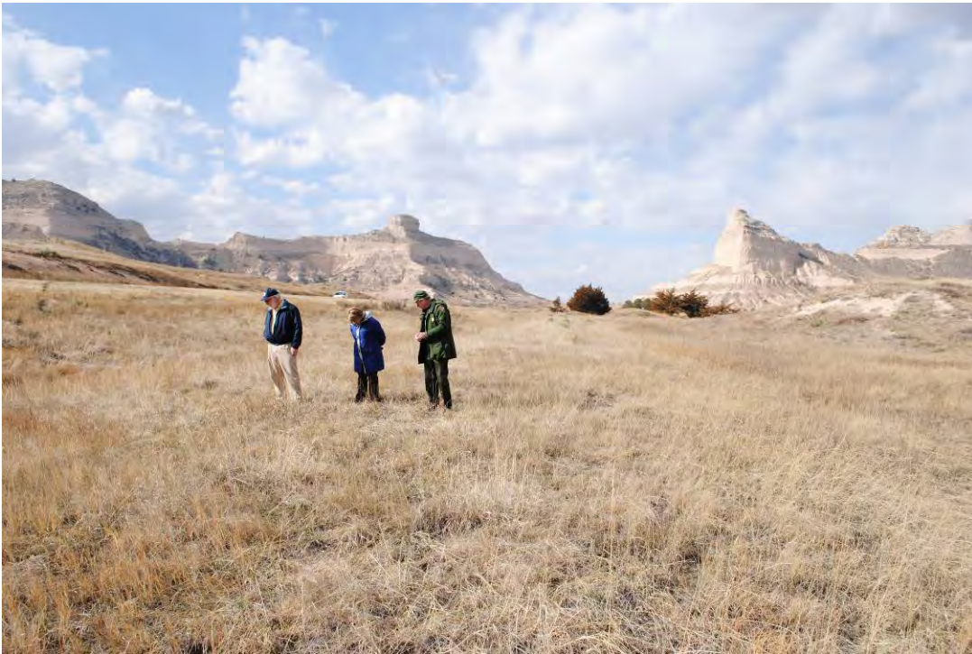
Figure 3 - 41. North side of county road Old Oregon Trail looking west in Character Area C (2009) (MBD DSC_0058.JPG)