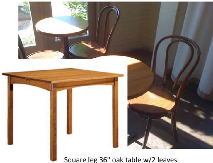
Square leg 36" oak table w/2 leaves