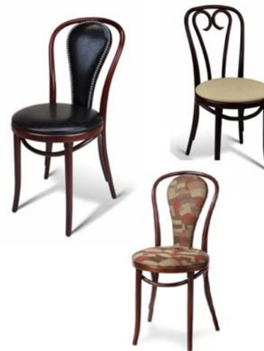
Variations on Thonet chairs - plain, upholstered, leather with nail head trim