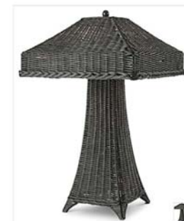
Wicker table lamp