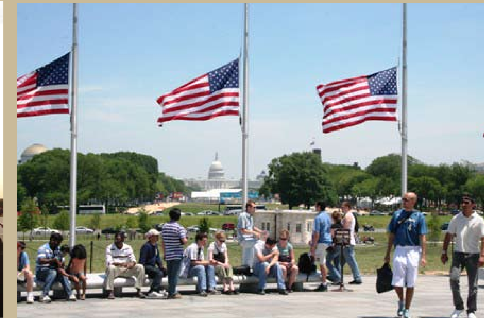
Visitors waiting to enter the Monument