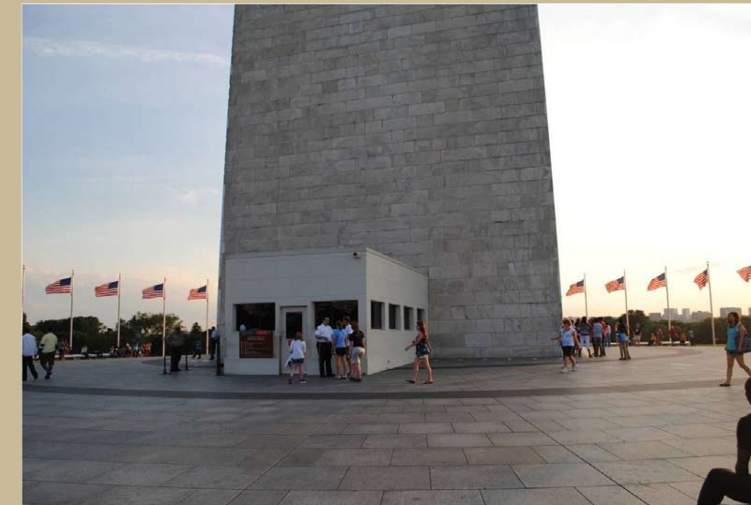
Temporary visitor screening facility

In 2002, the NPS completed a design for the Washington Monument Permanent Security Improvements that included a comprehensive landscape solution for a perimeter vehicular barrier system and a new screening facility. However, only the vehicular barrier system and a portion of the landscape design were implemented. The NPS is currently revisiting the feasibility of a new entrance and visitor screening facility and the removal of the existing temporary facility. These proposed actions are the subject of this EA and are explored in several alternatives.