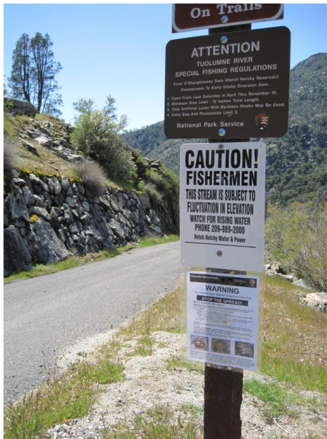
Road to Below O'Shaughnessey Dam