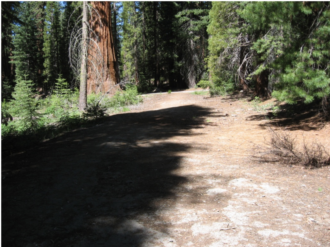
Abandoned asphalt to be removed (2)