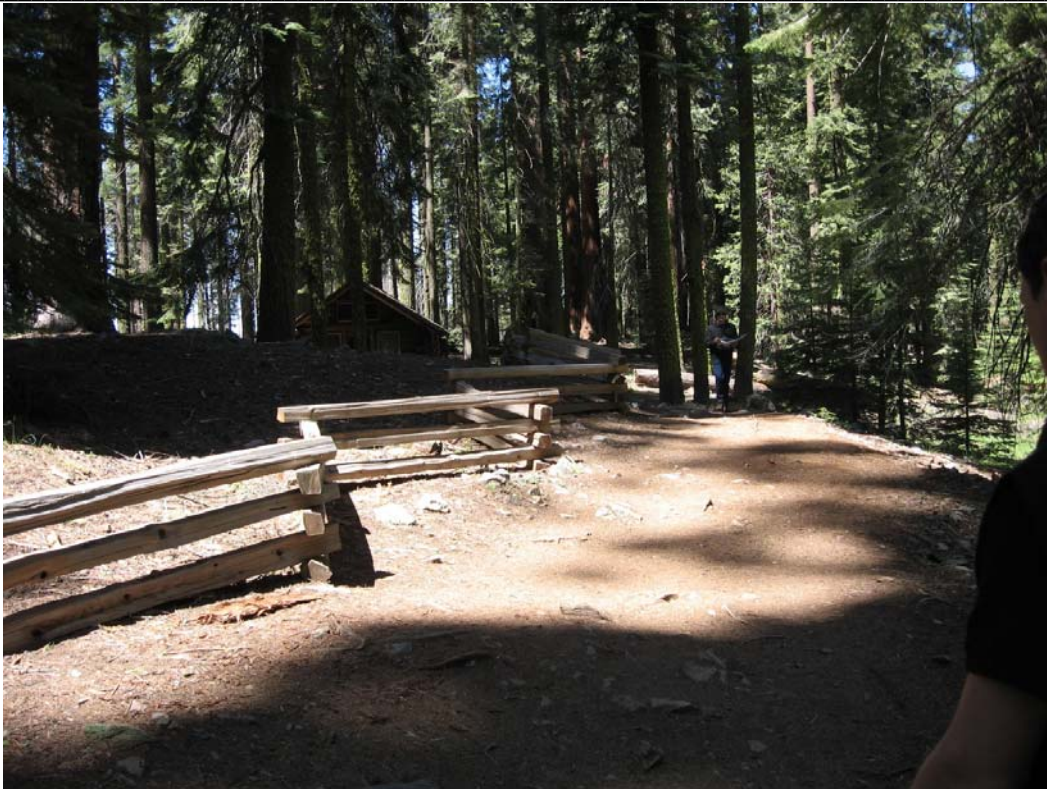
Zigzag style fence to be constructed