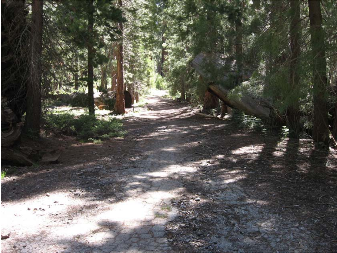
Abandoned asphalt to be removed (1)