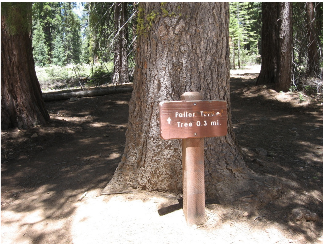
Broken or damaged signs to be replaced