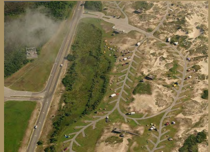
Marina and Oregon Inlet Campground, Cape Hatteras National Seashore