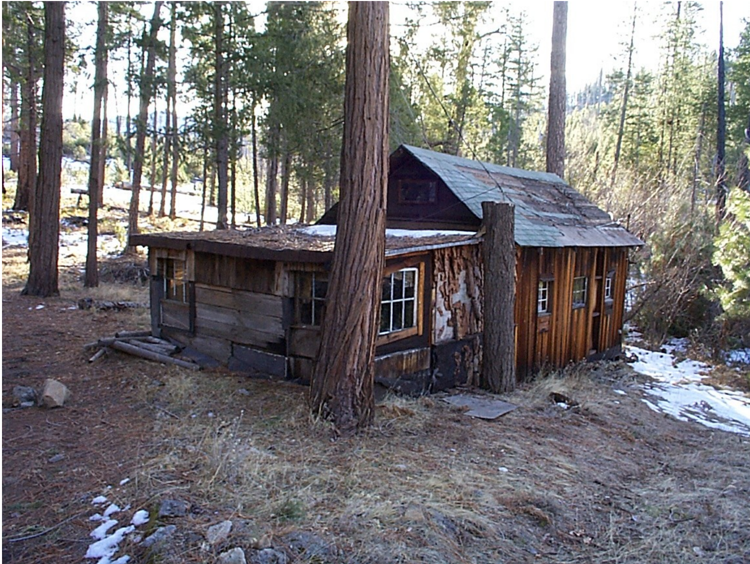
Brandt Cabin (Foresta)