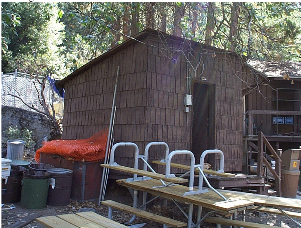
Storage Building #534