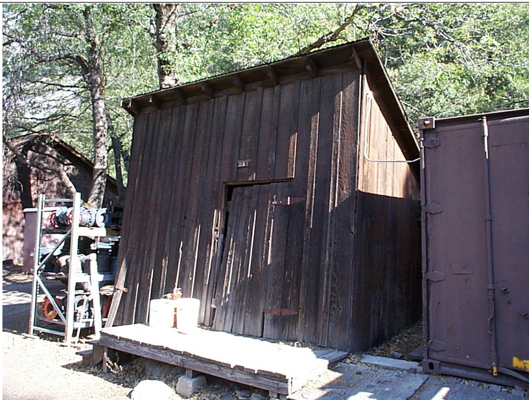
Storage Building #521