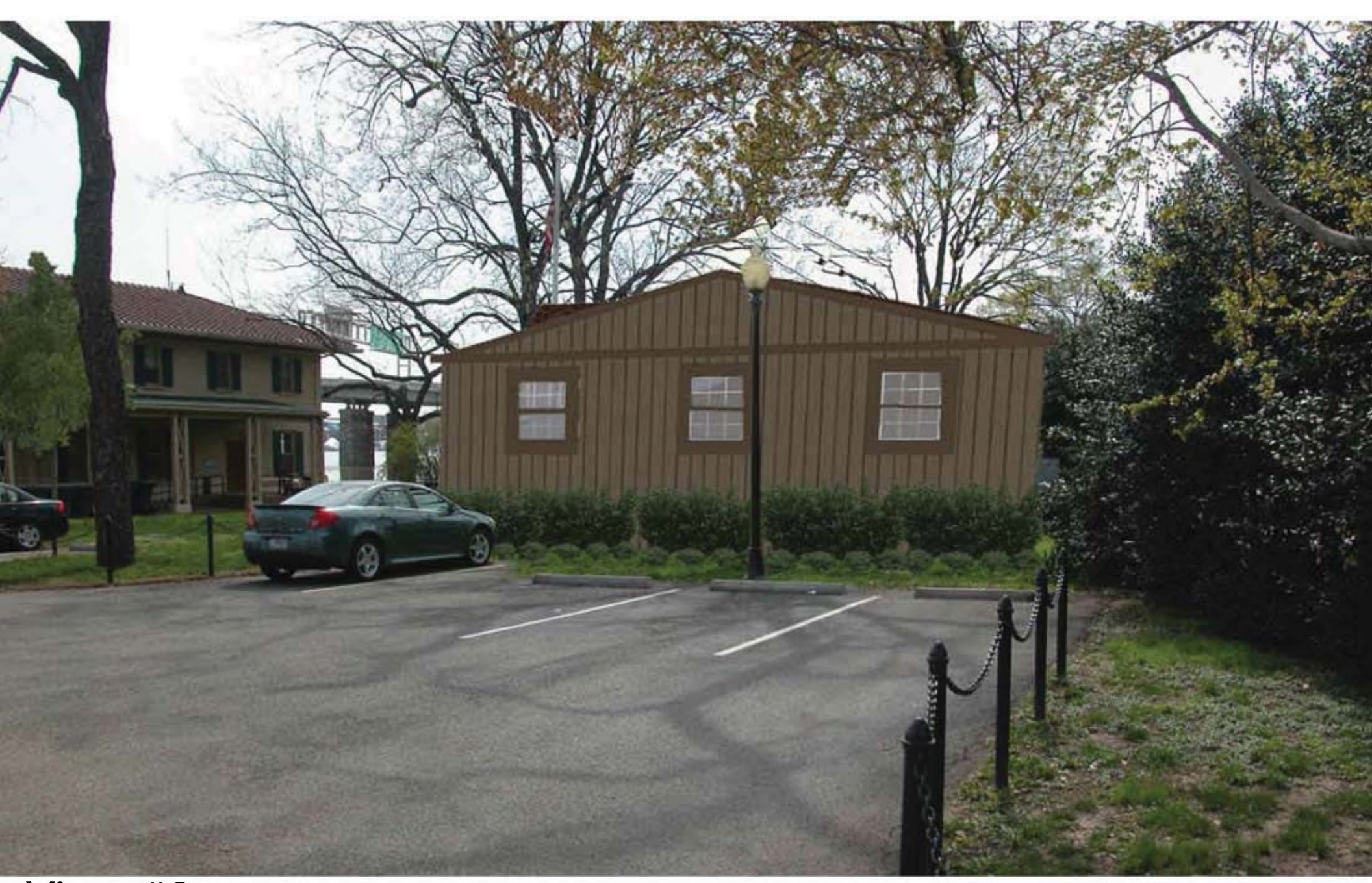
View #2 Proposed Condition