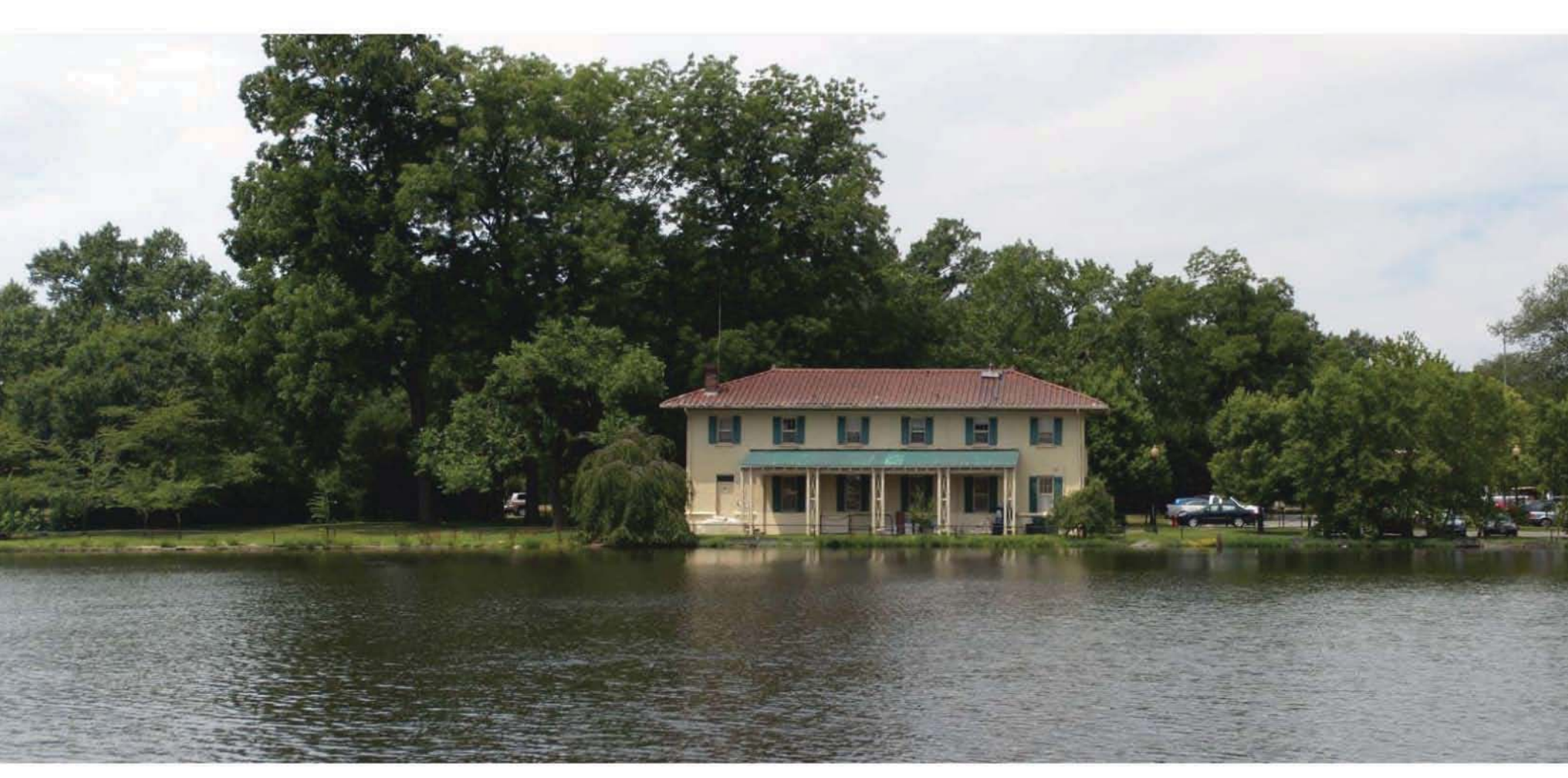
View #4 Existing Conditions