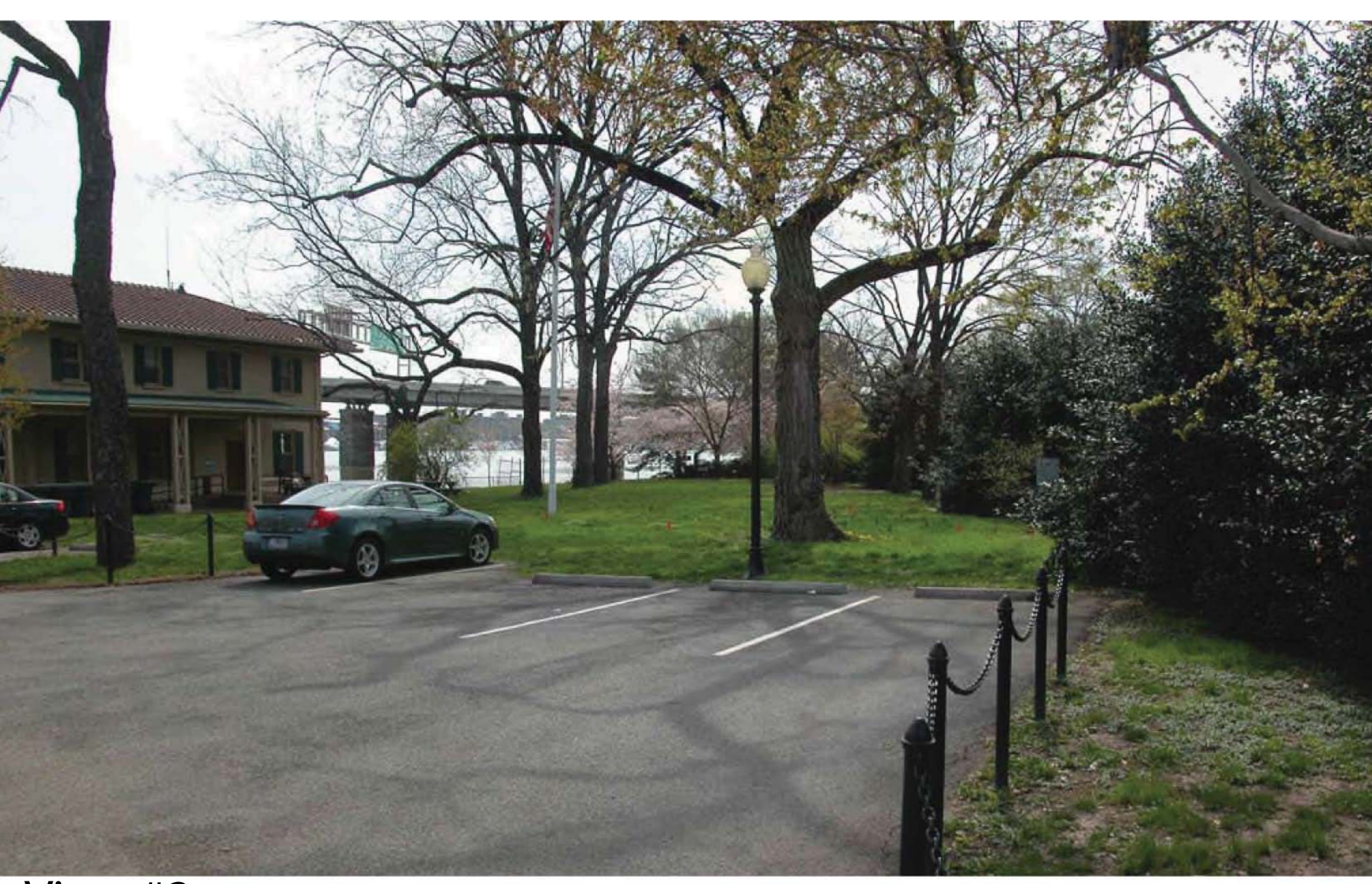
View #2 Existing Condition