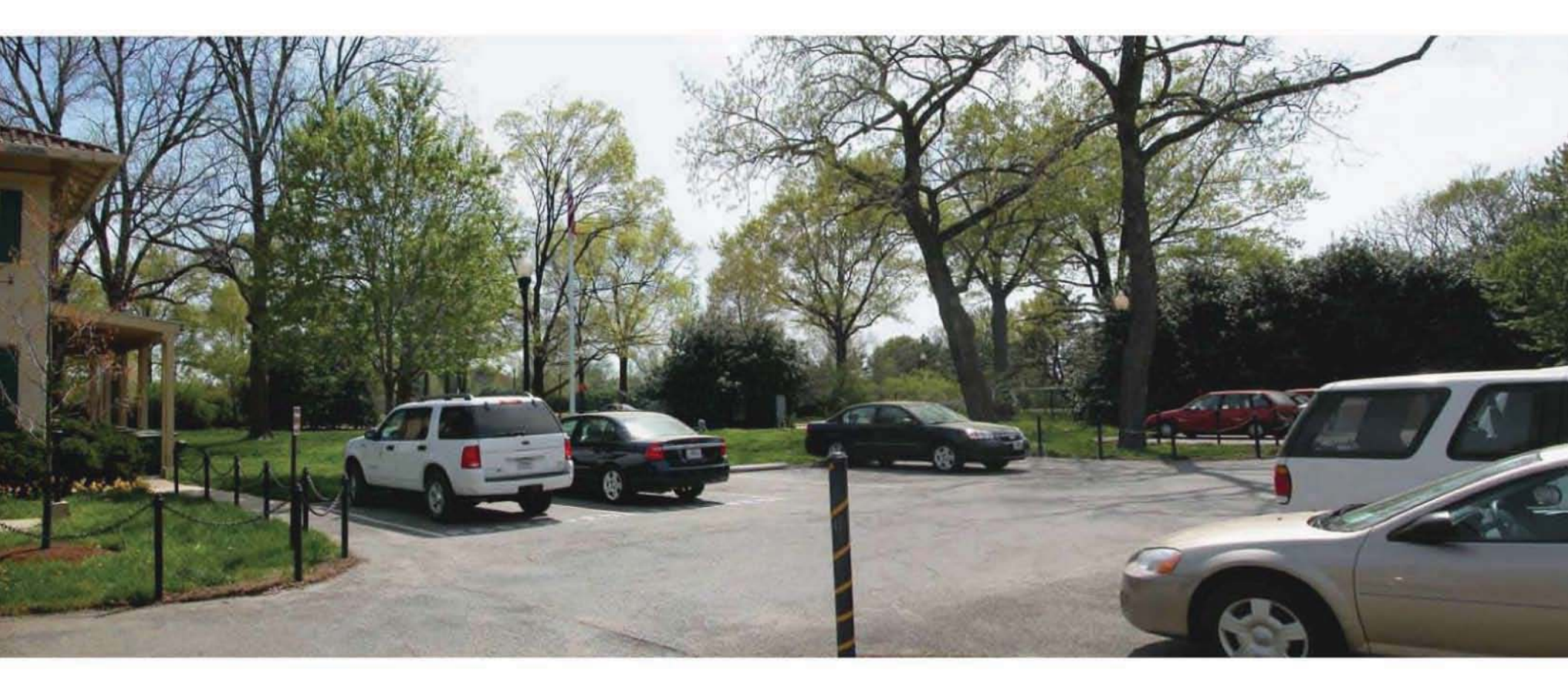
View #3 Existing Condition