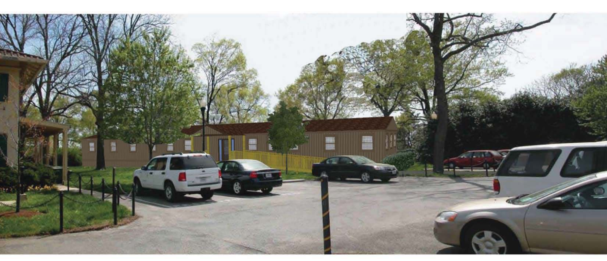
View #3 Proposed Condition