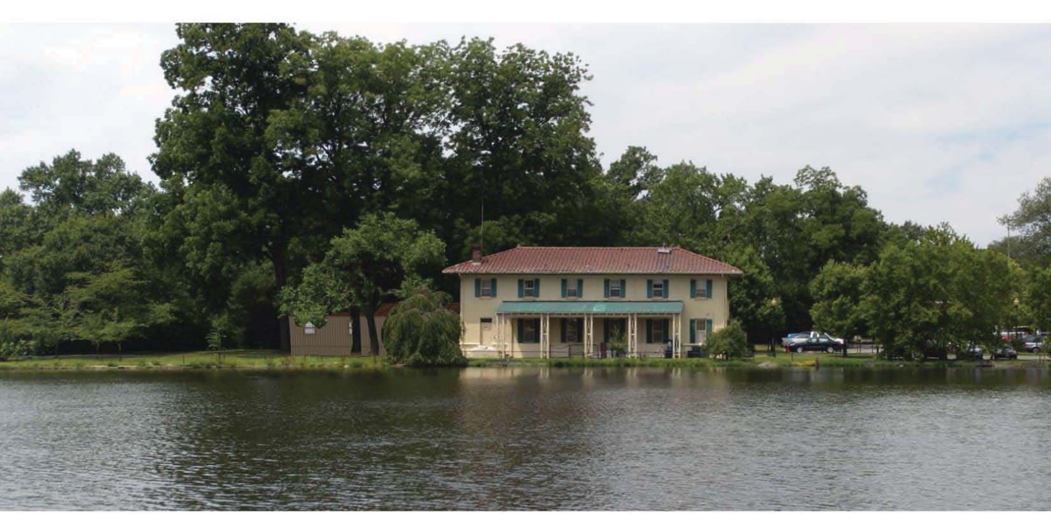
View #4 Proposed Conditions