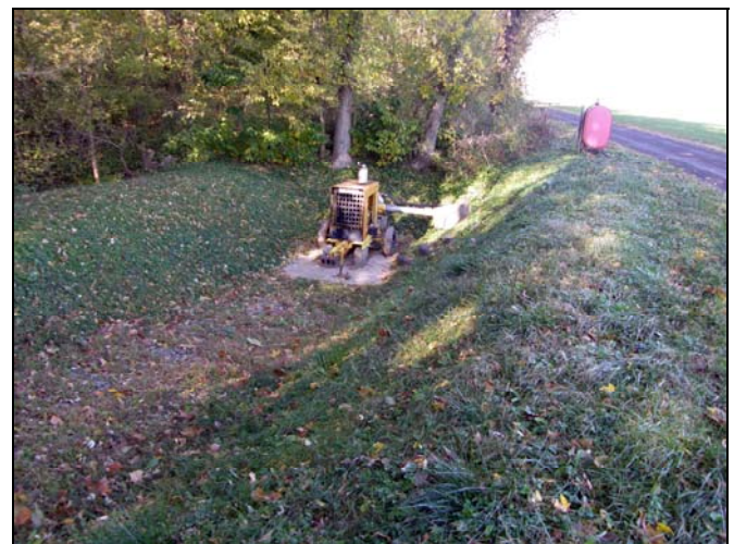
Line/Pump #2. Pump located off NPS property.

The purpose of the project is to address a request from Summit Hall Turf Farm to modify Line #2 and complete the farm's irrigation system by installing Line #3, as outlined in the Warranty Deed established in 1975. Under the terms of the deed, Summit Hall Turf Farm must complete the modification of Line #2 and installation of Line #3 under the supervision of a representative of the Superintendent of the C&O Canal NHP and insure full compliance with agreed upon terms of installation.