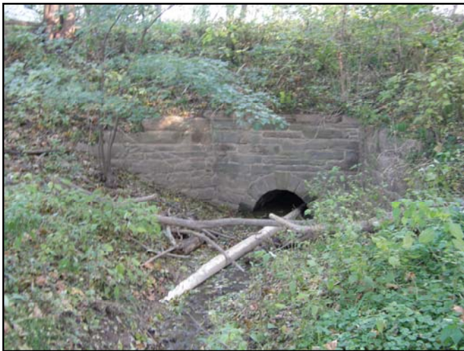
Line #2 running through Culvert #39

July 19 - August 20, 2010 Meeting – July 21, 2010