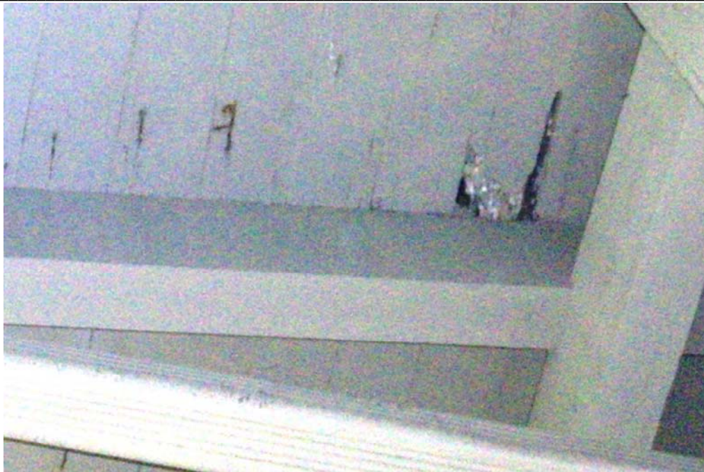
Deteriorated privacy partitions in need of replacement.