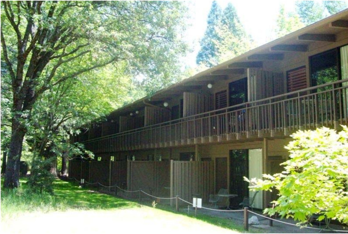
Existing balcony at Yosemite Lodge.