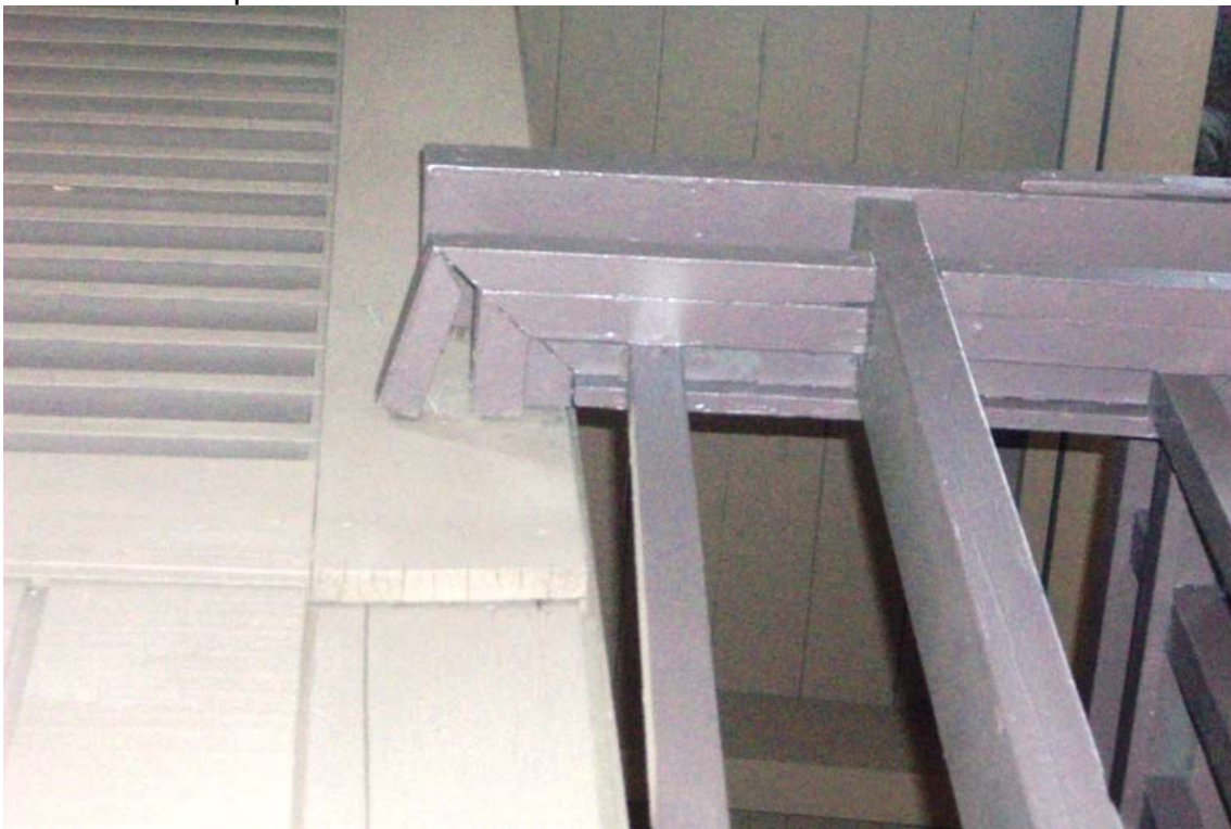
Balcony railing to be replaced.