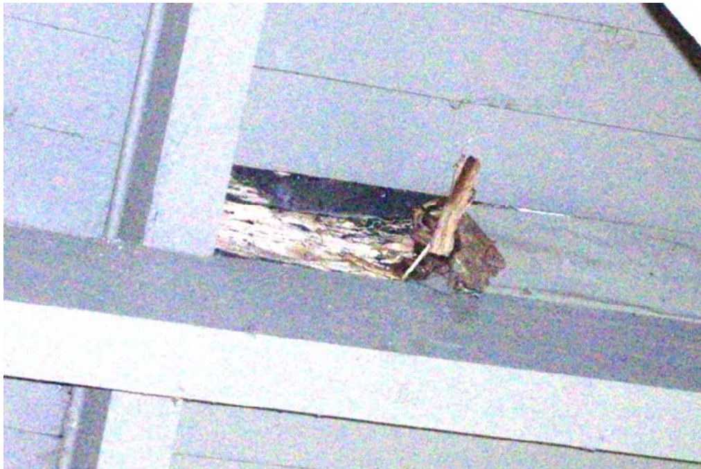
Deteriorated privacy partitions in need of replacement.