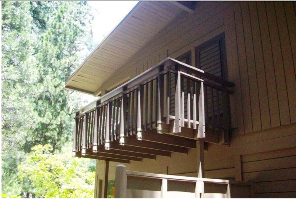
Balcony deck and railing to be replaced.