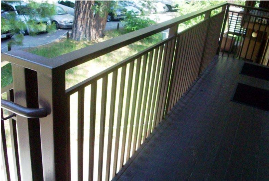
Recently replaced railings and decks