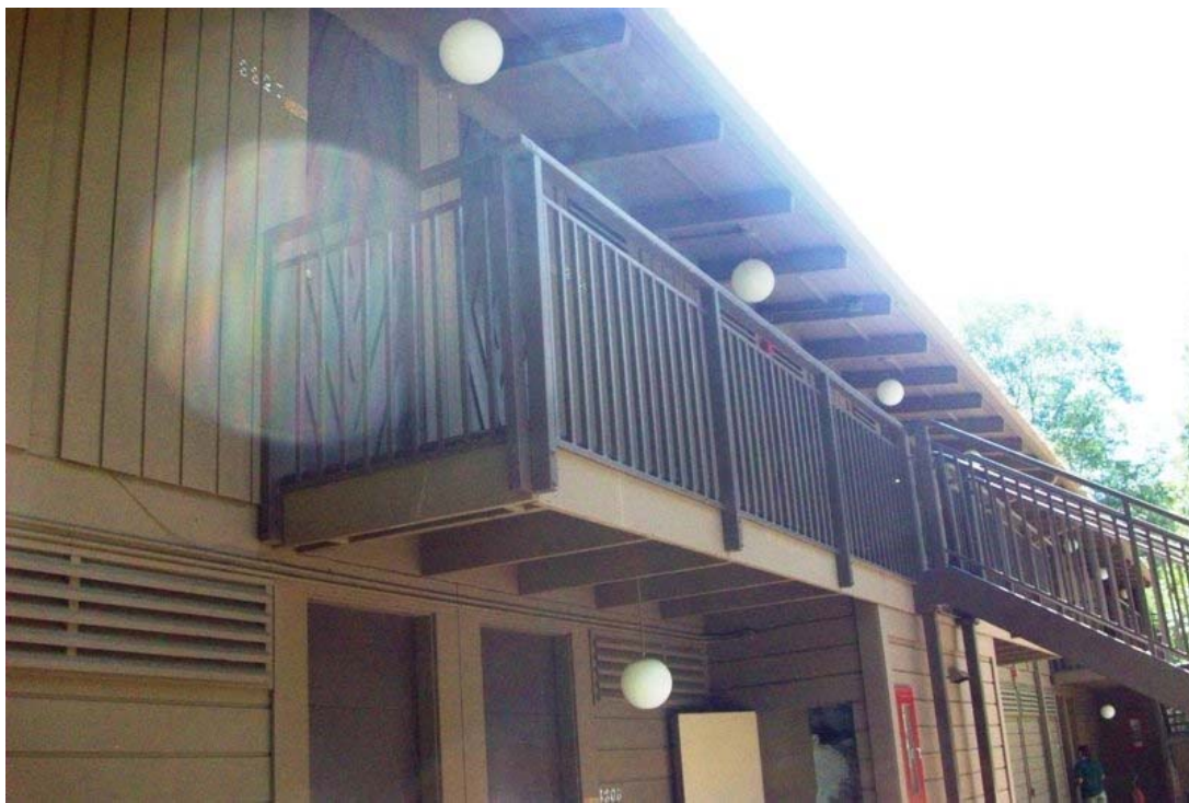
Recently replaced balcony at Yosemite Lodge. New balcony decks, railings, and partitions will look like this.