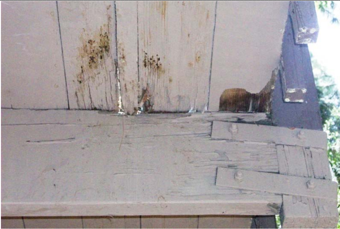
Rotted deck to be replaced