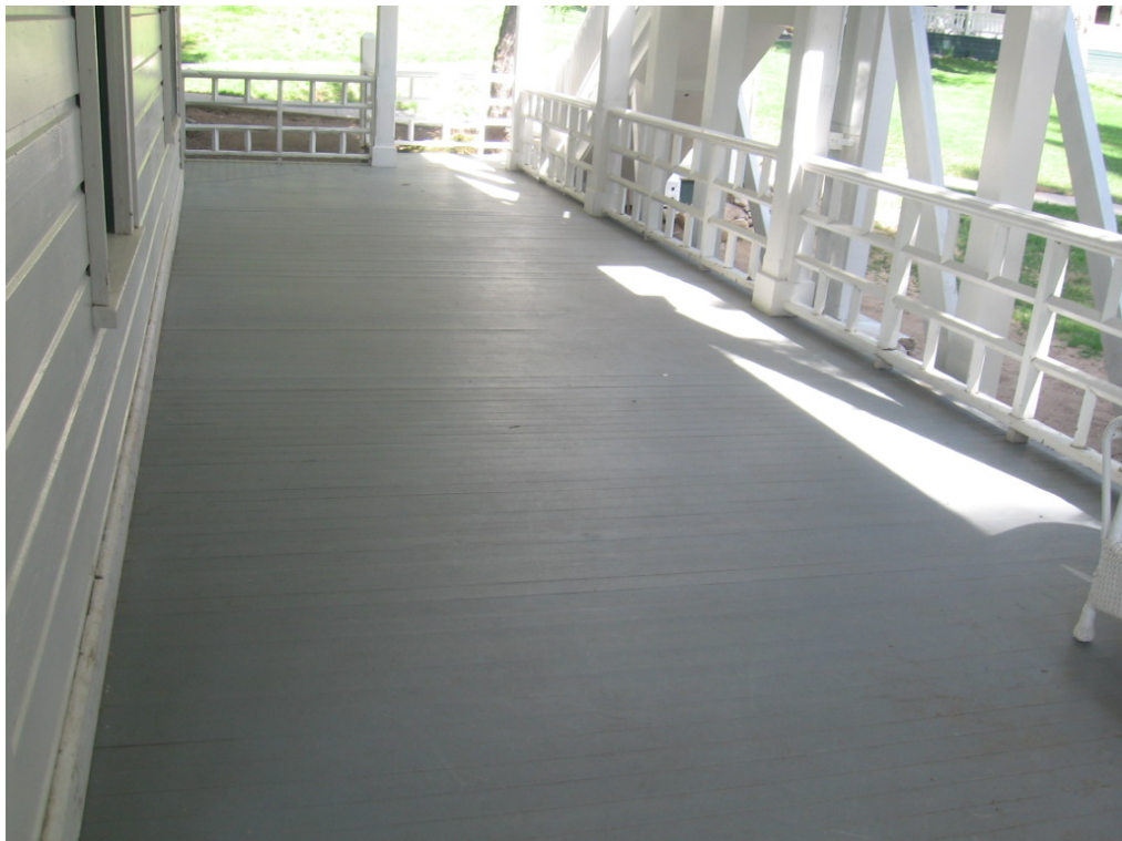
New 2 nd story decking will look similar to this decking which is located on the first floor of the main building at Wawona Hotel.