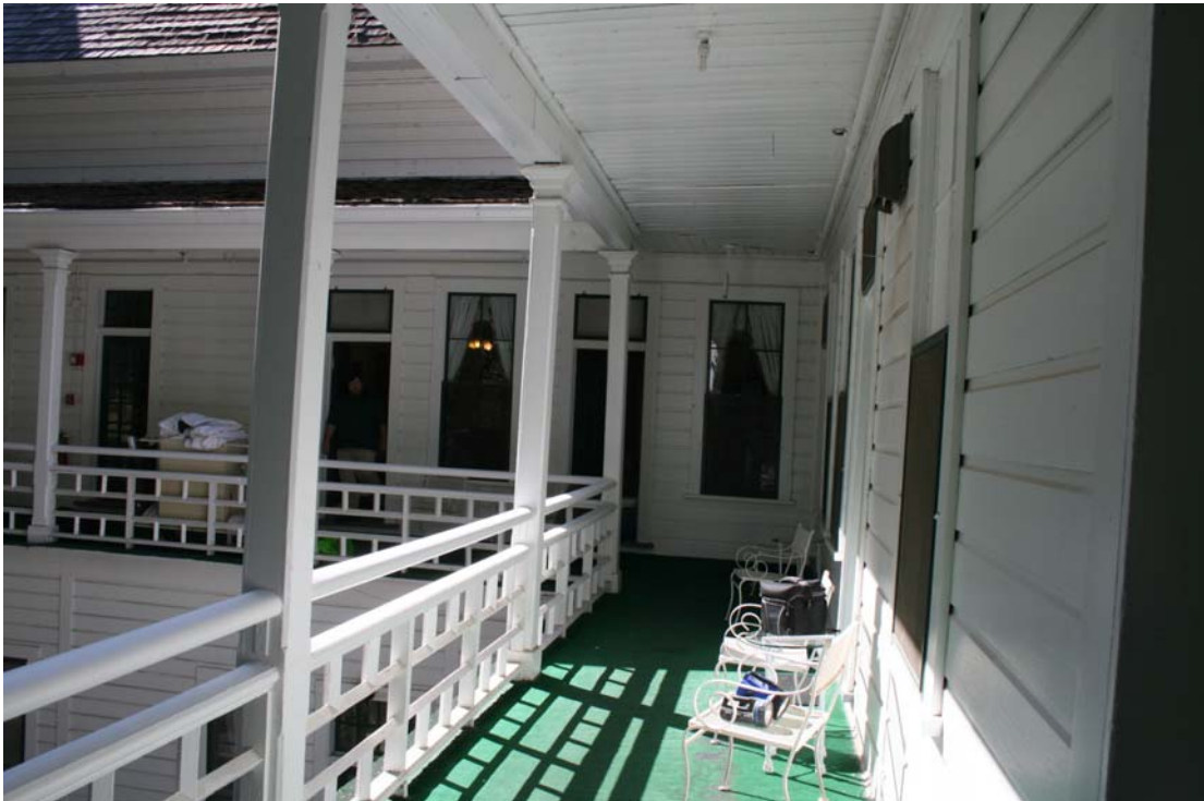
Second story veranda on the back side of the main hotel (east).