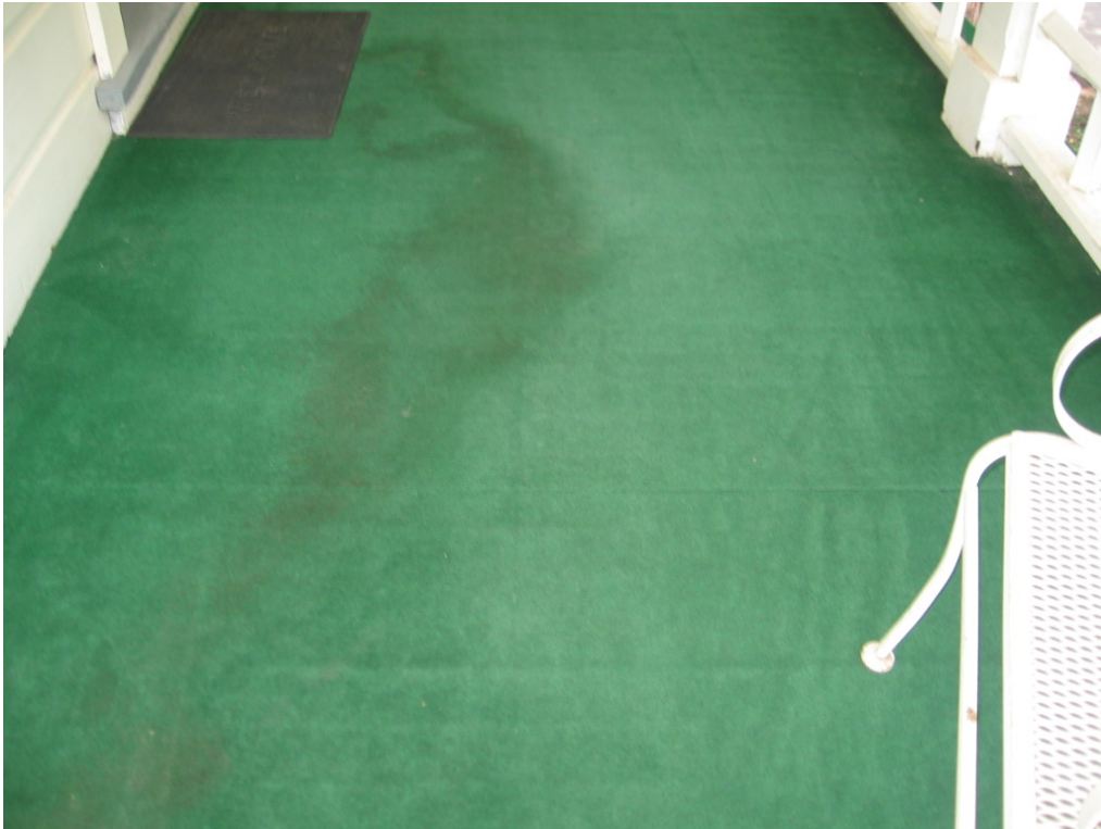
Water damage/stain on veranda carpet.