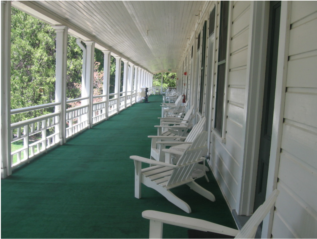
Existing green carpeting will be removed and decking below will be replaced in kind.