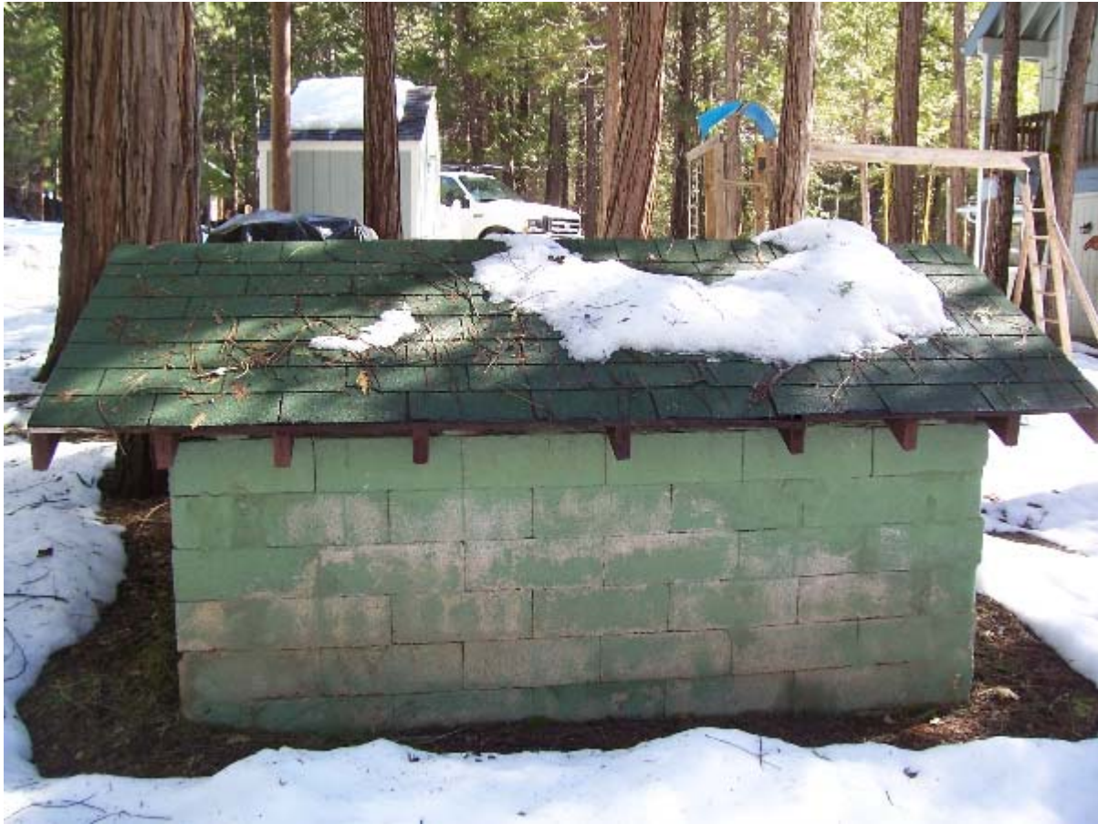
Pump house building #4161 - 2591 Van Campen Way