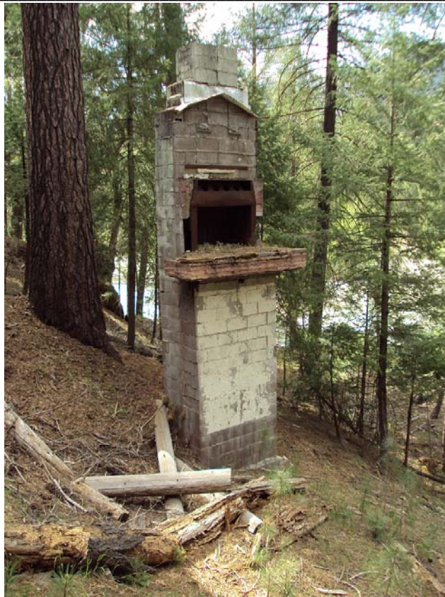
Veneer Chimney South of the Crews House