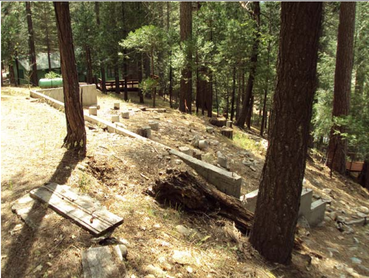
Crew's House – 7975 Forest Drive