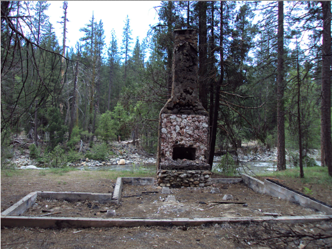
Building #4205- 8202 River Street