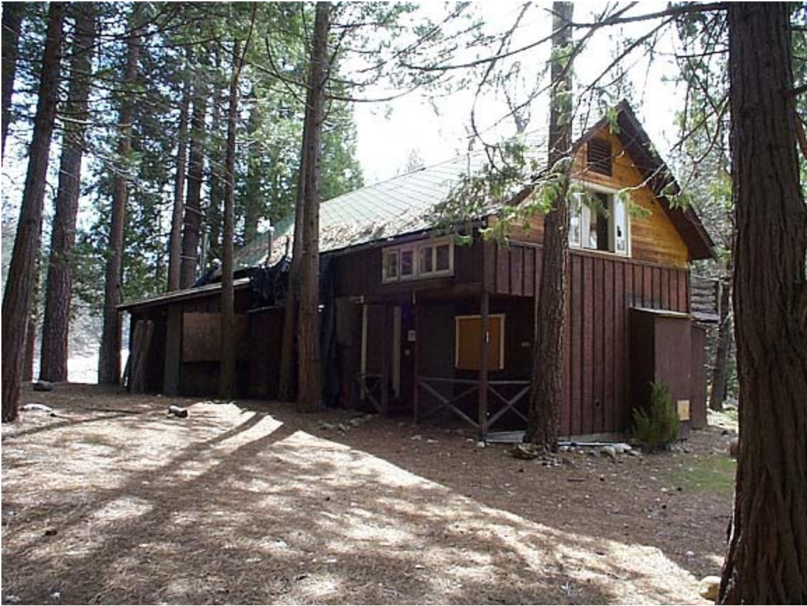
Redwoods House #2571 - River View Road