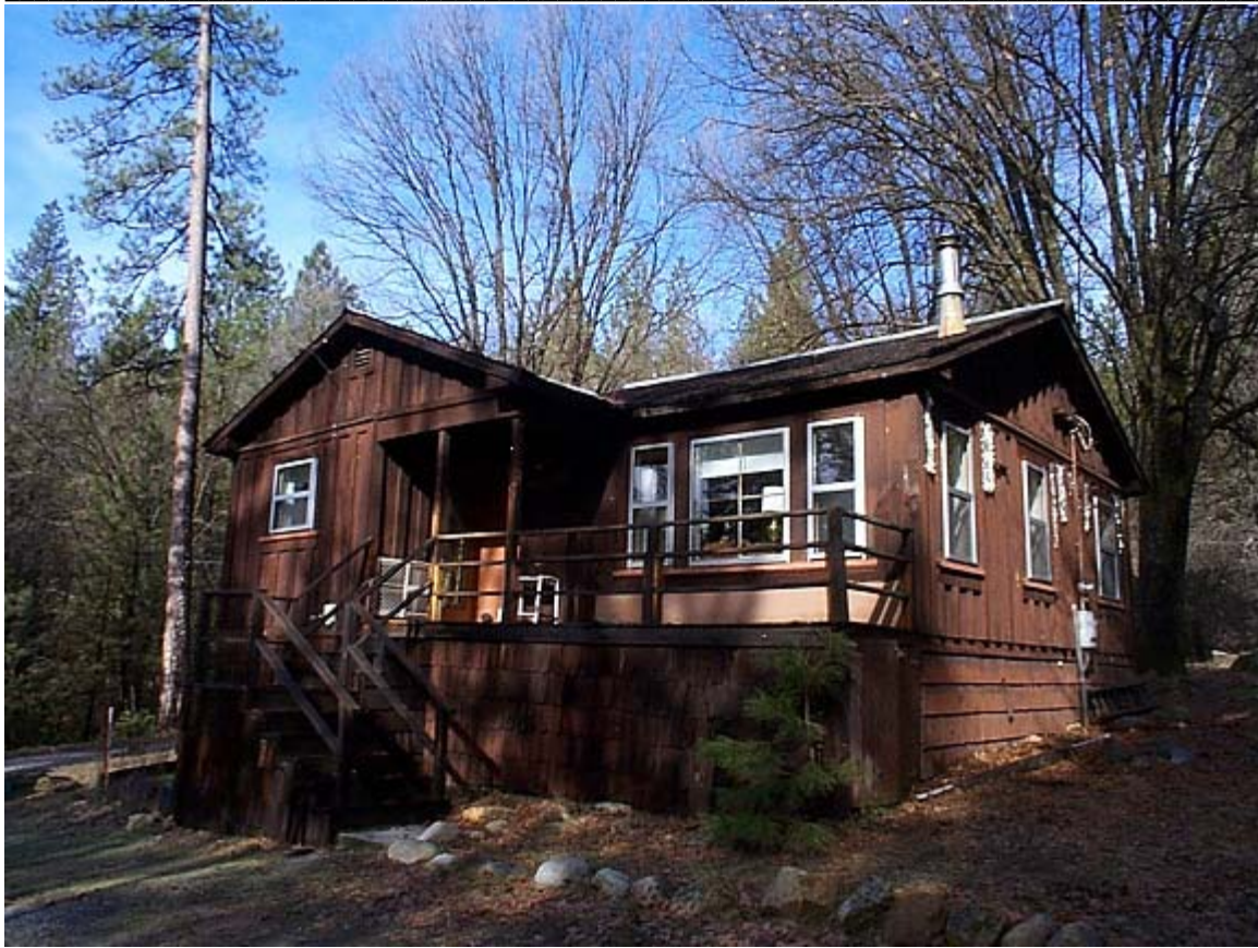
Building #4048- 2652 Spelt Road