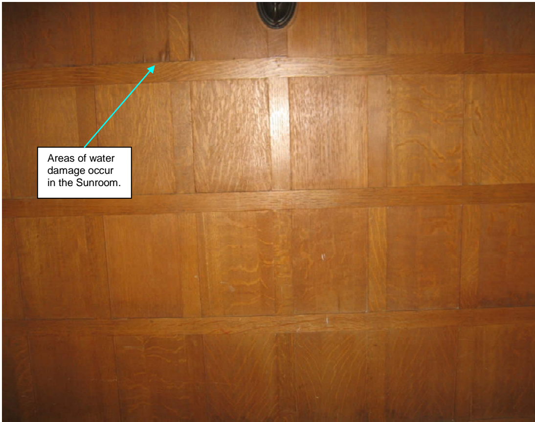
Wawona Sunroom Oak Wood Wall Paneling. Note the unique wood grain pattern of each panel and the raised oak relief separating each panel.