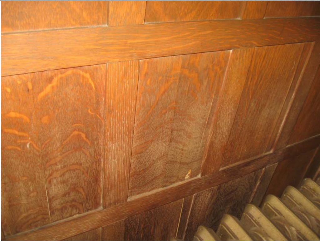
Wood paneling next to the two radiators in the sunroom is badly damaged and in some cases, requires replacement in-kind.