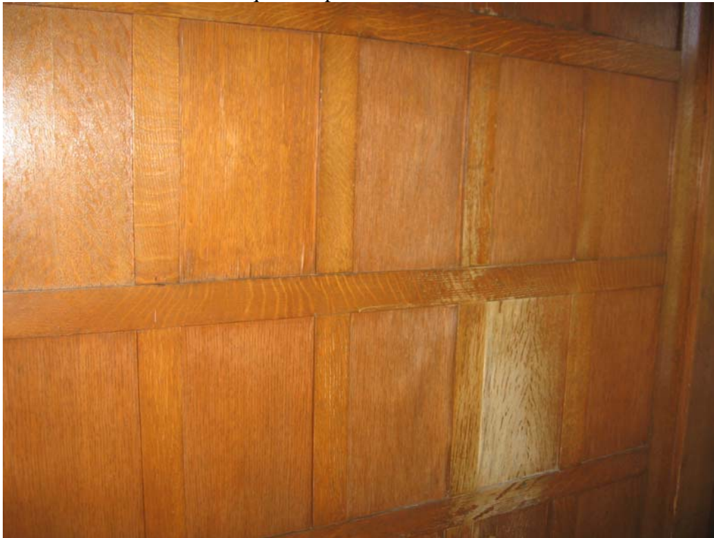
This is an example of a panel that requires minor repair and refinishing to match the rest of the wall.