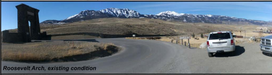
Roosevelt Arch, existing condition