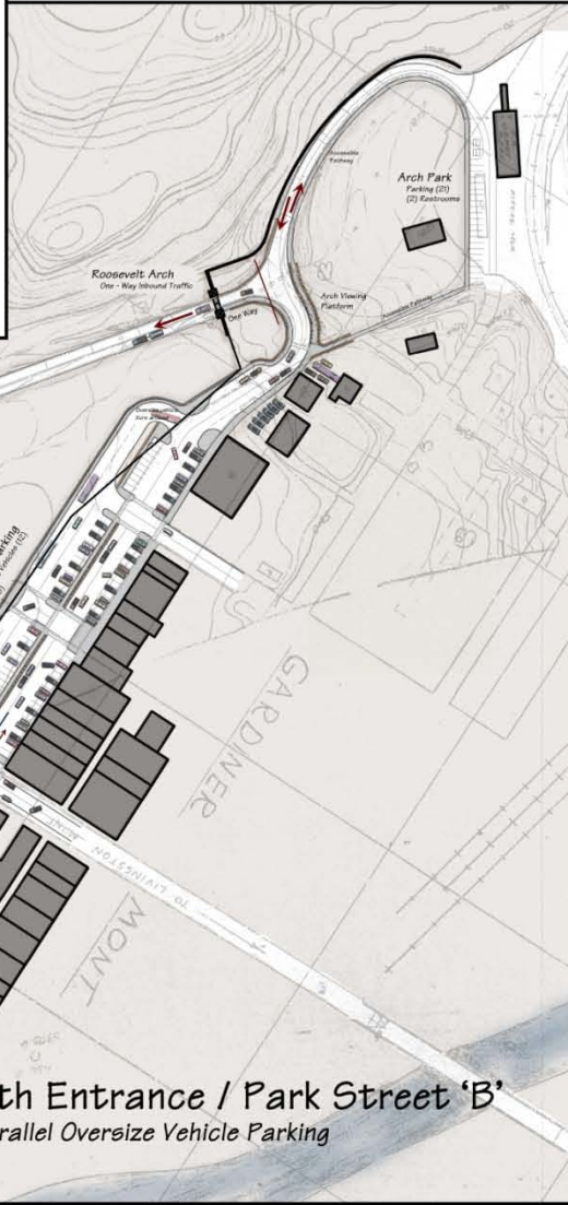
North Entrance / Park Street 'B' Parallel Oversize Vehicle Parking