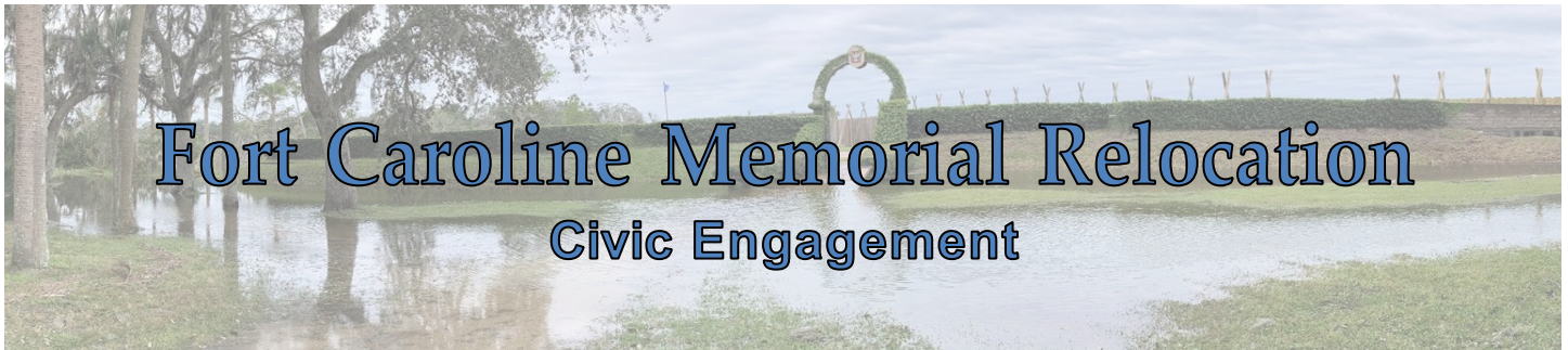
Figure 1. Flooded Fort Caroline

Timucuan Ecological and Historic Preserve protects the natural ecology of over 46,000 acres of lands and waters and over 12,000 years of human history along the St. Johns and Nassau rivers in northeast Florida.