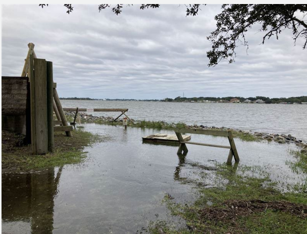
Figure 3. Flooding at Fort Caroline

We invite you to attend the in-person/virtual public meeting to learn more about the project and provide comments; please see our PEPC website for the most up to date information.