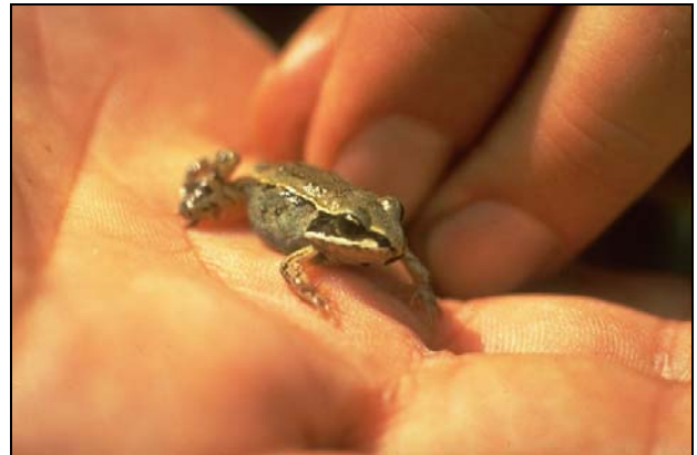
Wood frog – Rana sylvatica.

Through interpretation, park staff facilitate public understanding, appreciation, and protection of fish, wildlife, habitats, and management of diverse northwest Alaska ecosystems.