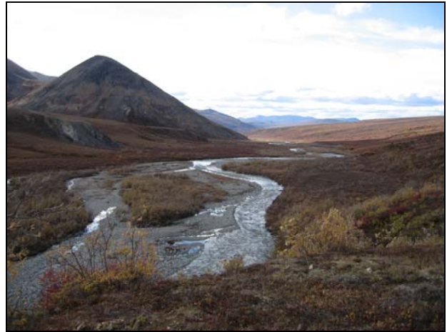
The upper Salmon River, a designated Wild River.