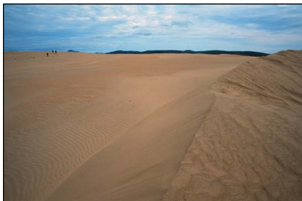
The Great Kobuk Sand Dunes.

Park staff facilitates public understanding, appreciation, and protection of all the elements of the ecosystem.