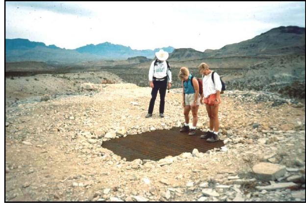
Figure 2. Example Grate

If bat surveys indicate no use by bats, the shaft will be closed by grating. The grate will be placed over the shaft, extending approximately 2 feet outside the shaft collar, flush to the ground. Due to the stability of the rock around the shaft collar, the grate will be bolted to the rock. The grate will be constructed from EM3 3lb grating with spacing of grids measuring 0.938 x 3.438" over a framework of 3" x 3" x 38" angle iron or similar strength steel that meets the 100% American-made requirement under the American Recovery and Reinvestment Act of 2009 (ARRA). The grate will prevent park staff, visitors, and wildlife from falling into the shaft. A photo of a similar grate at Big Bend National Park is shown on the right.