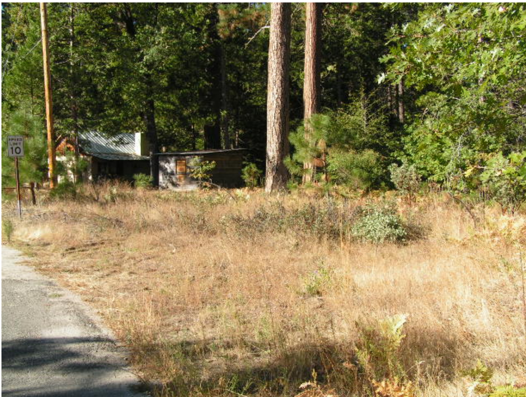
Proposed Well Site