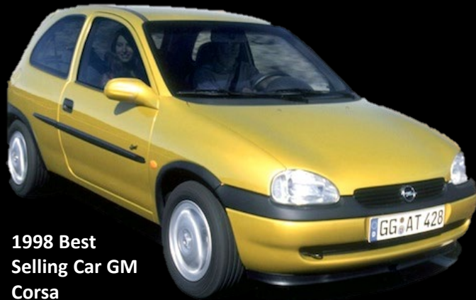
1998 Best Selling Car GM Corsa