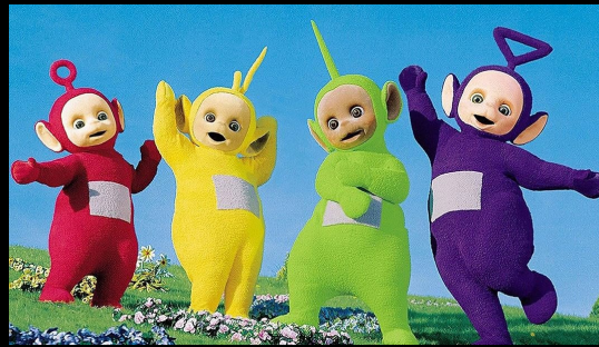
1998 Best Selling Toy: Teletubbies

The last time fees for the private river permit were raised was 1998