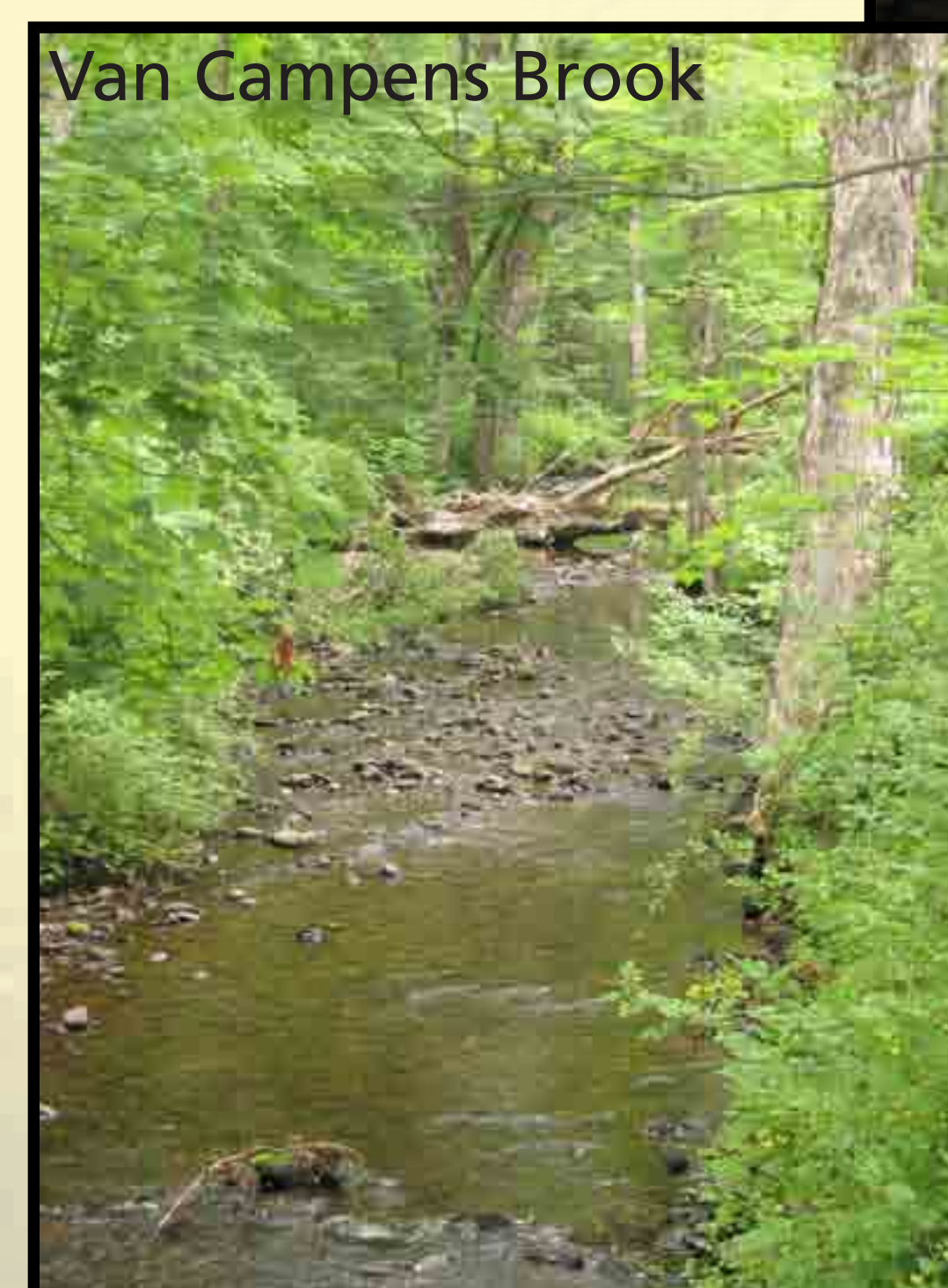
Van Campens Brook