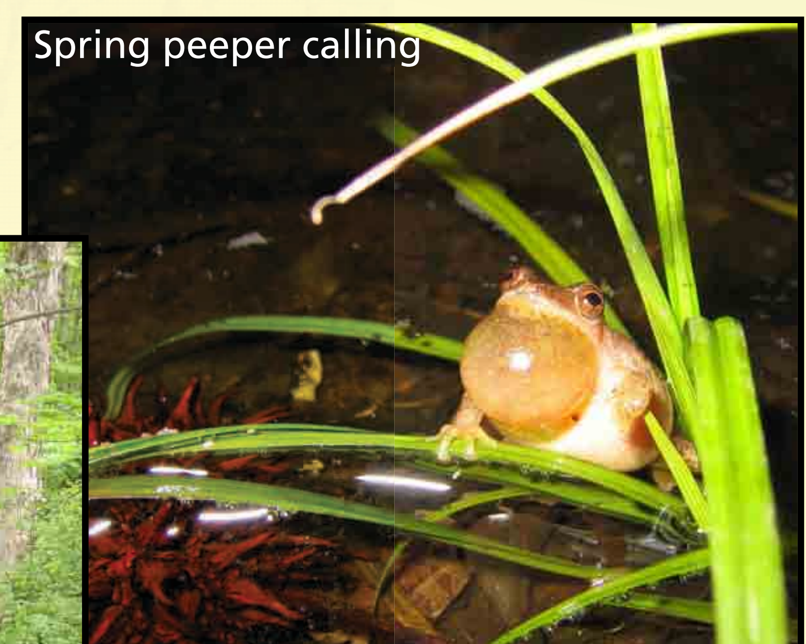
Spring peeper calling