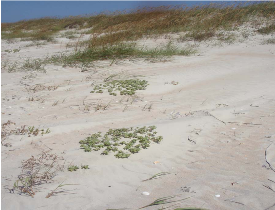
Seabeach Amaranth plants building dunes on Shackleford Banks.