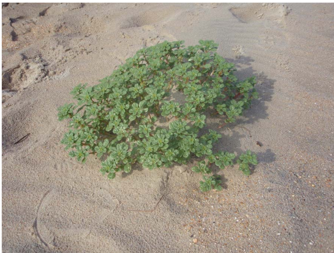
Seabeach Amaranth plant on the soundside of Beaufort Inlet spit.