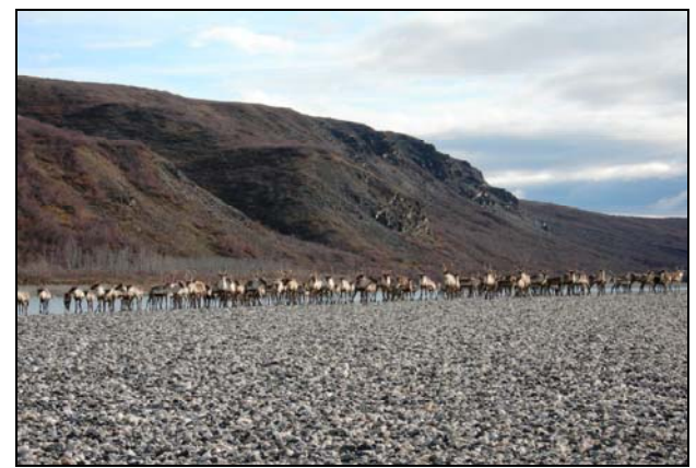
Caribou getting ready to cross the Noatak river, heading south in the fall.

NPS managers work collaboratively with local residents to document their subsistence way of life for educational purposes and to inform management decisions.