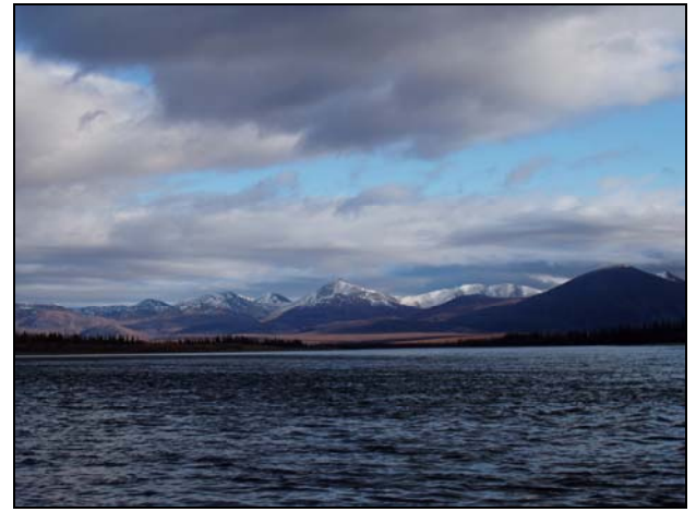
Noatak River with the Maiyumerak Mountains in the background.

NPS managers work collaboratively with stakeholders to preserve the multiple values of wilderness.