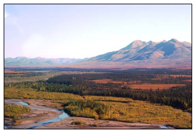
Aerial view of Eli River drainage in Noatak National Preserve during peak fall colors.

The Noatak basin supports one of the richest floral assemblages in the northern latitudes. It includes geomorphically diverse mountain-rimmed tributaries where biological and geological processes continue to unfold as they have throughout history.