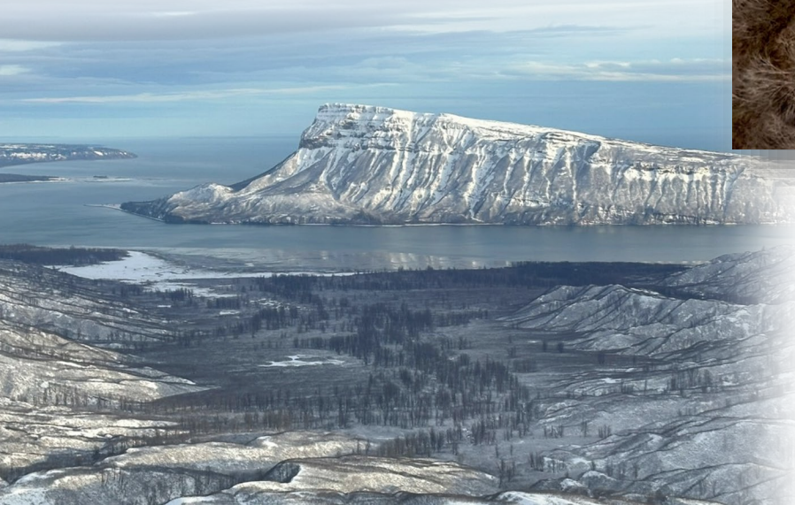
Left: View of Tuxedni Channel and Chisik Island from Bear Valley.