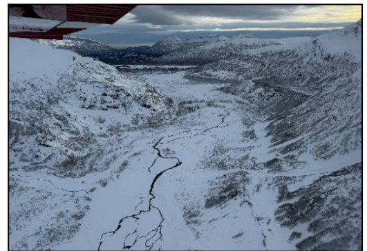
View of the Johnson River in December 2023, looking southeast.

In 2019, CIRI and HighGold mining company (now Contango Ore, Inc.) entered into a 10-year lease of the Johnson Tract for mineral exploration. In 2020, HighGold worked with the NPS for authorization to access NPS land around the Johnson Tract for certain activities associated with their mineral exploration. In January of 2023, CIRI began discussions with NPS to advance the conveyance of the easements.