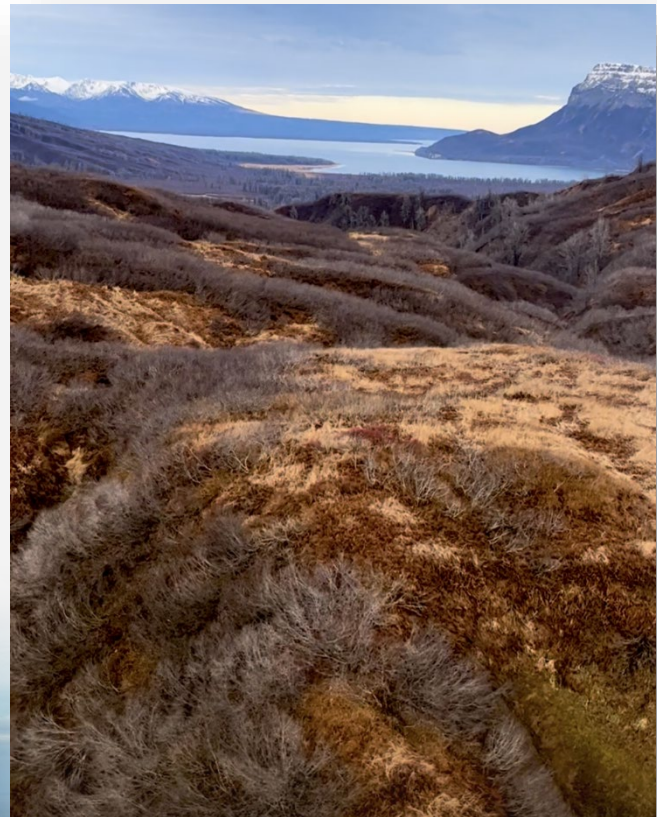
Above: View of Tuxedni Bay and Channel from Bear Valley.