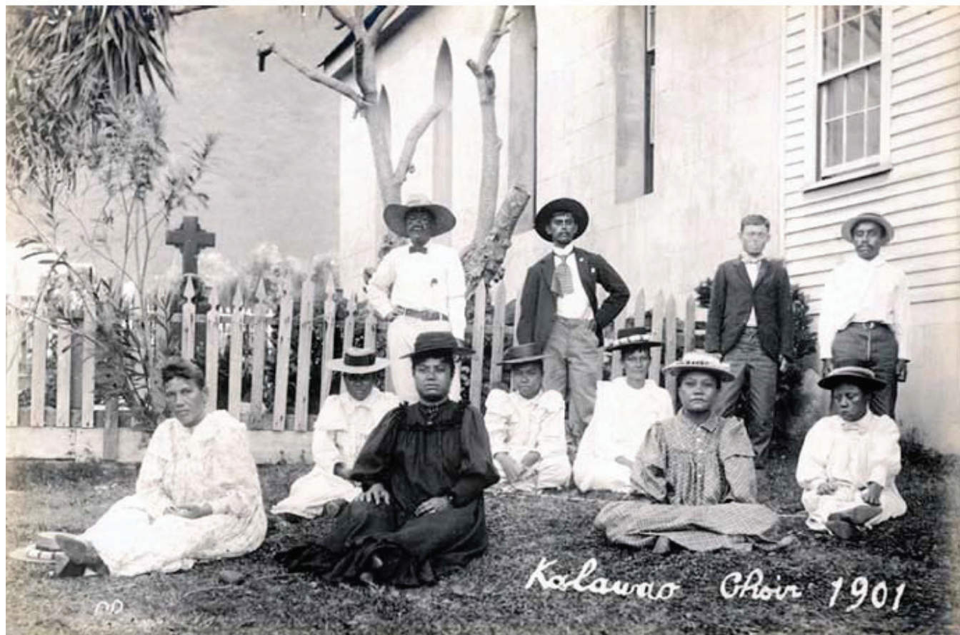
The Kalaupapa Choir, 1901

Ka 'Ohana O Kalaupapa Position Paper of Recommendations for Kalaupapa National Historical Park's General Management Plan.