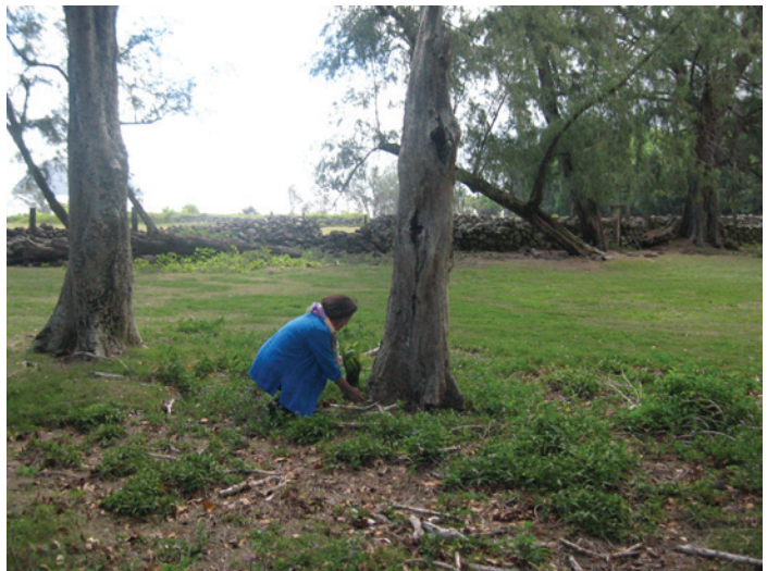
Congresswoman Mazie Hirono places ho'okupu at the base of a tree on the site of the Old Baldwin Home at Kalawao that is the preferred location of Ka 'Ohana O Kalaupapa for the Kalaupapa Memorial. The exact site for the Memorial will be determined during an Environmental Assessment.

These leaders should be recognized not only for their many contributions to the people of Kalaupapa, but for the relationships they forged with the community that made their work possible and all the greater. Father Damien will be declared a Saint of the Catholic Church in October, 2009, and Mother Marianne could be declared a Saint in the near future. Their canonizations will bring more international attention to Kalaupapa. Such attention – and an expected increase in requests to visit Kalaupapa/Kalawao – must be handled with respect and dignity to all the 8,000 people who died on the peninsula. Large numbers of daily visitors will ruin the sacredness of the area and diminish its spiritual power.