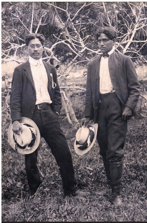
Two young men at Kalawao in the early days

“National historic landmarks are those buildings, structures, sites or objects determined to be nationally significant in American history and culture. This designation is the principle federal means of recognizing the national significance of historic properties. The historic architecture and cultural landscape of Kalaupapa settlement possess integrity of original location and workmanship, and intangible elements of feeling, association and visual beauty.”