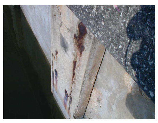
Photograph 5: Seawall detail