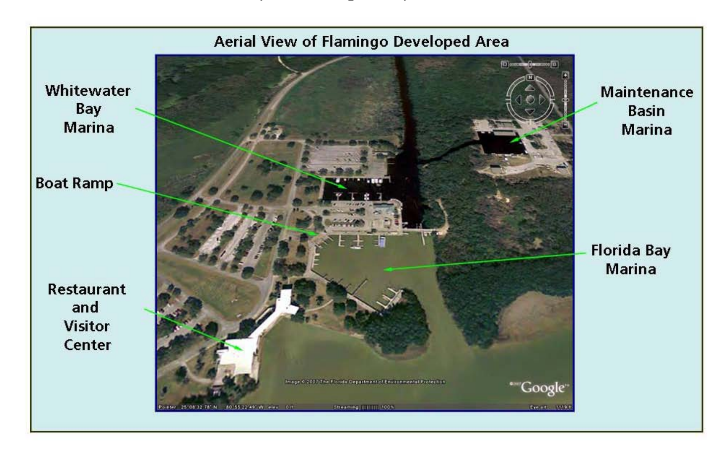
Photograph 2: Panoramic view of the Florida Bay marina