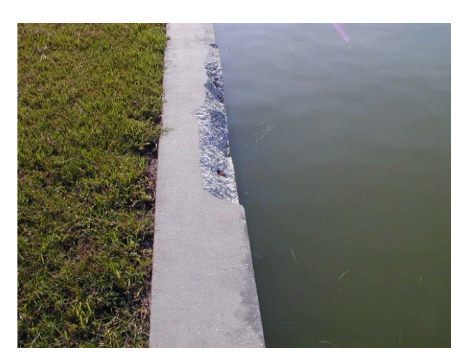
Photograph 7: Seawall cap