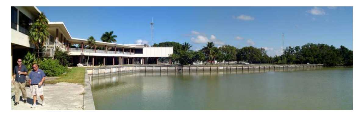
Panoramic view of the Flamingo Visitor Center and seawall

The National Park Service (NPS) is beginning an environmental assessment (EA) to address options for repairing deteriorating seawalls at the Flamingo Developed Area within Everglades National Park, Monroe County, Florida. This notice begins the EA process by requesting your comments on the scope of the analysis that will be conducted. Please submit any comments by January 16, 2010.