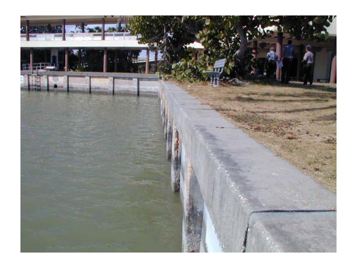
Photograph 4: Visitor Center seawall