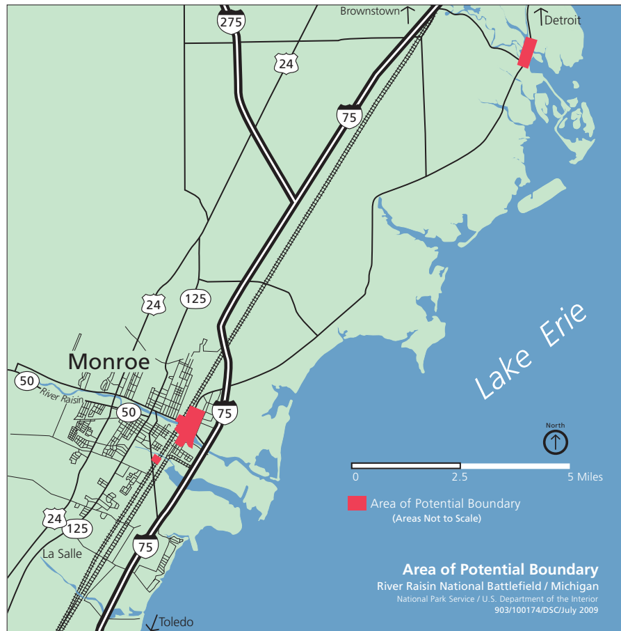
Figure 1: Proposed National Battlefield Park Map

least in part through local partnerships with private organizations and that there would be a volunteer base to support operations.