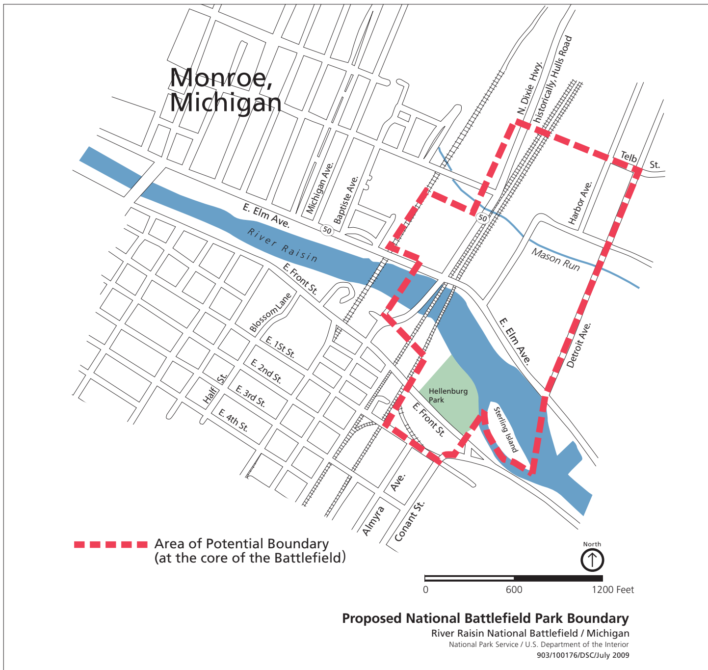
Figure 2: Proposed National Battlefield Park Map (detail)

another type of agreement (e.g., an easement).