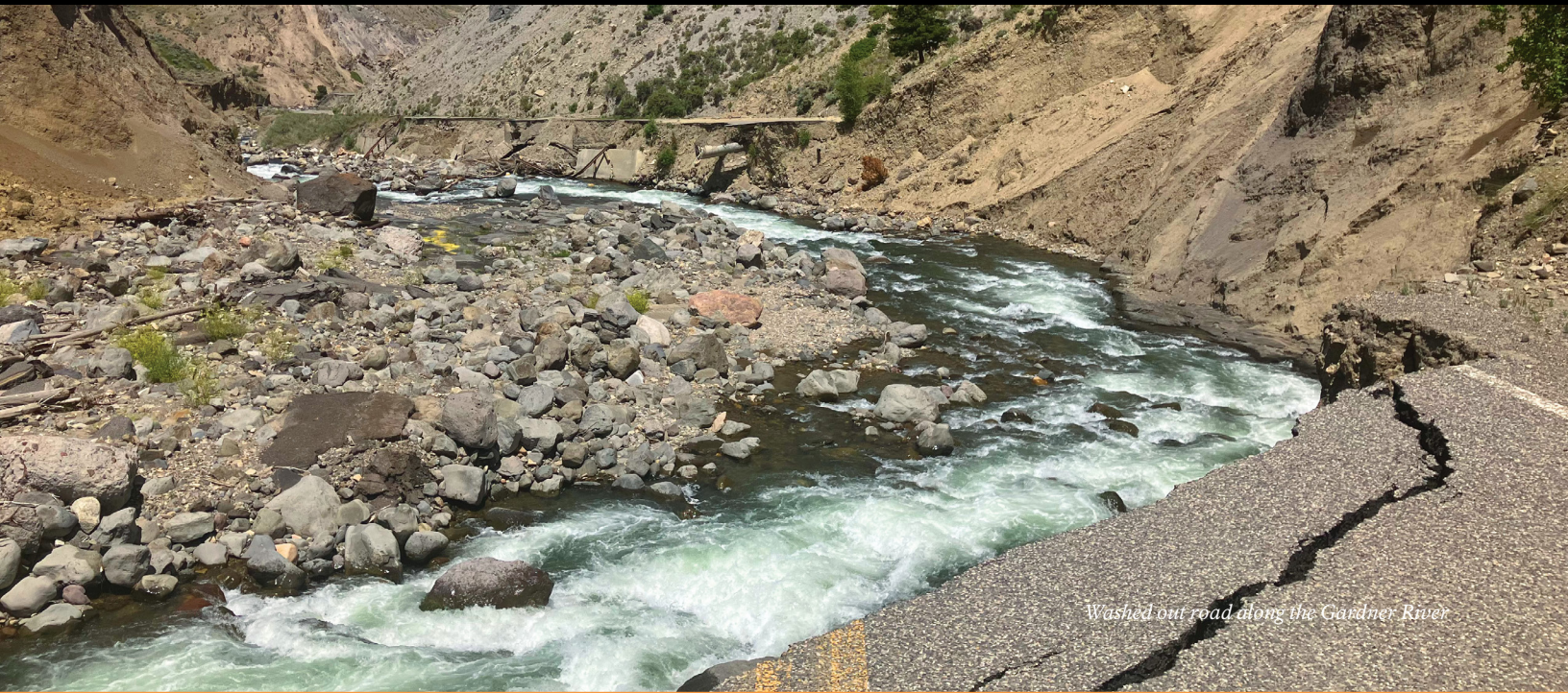
Washed out road along the Gardner River