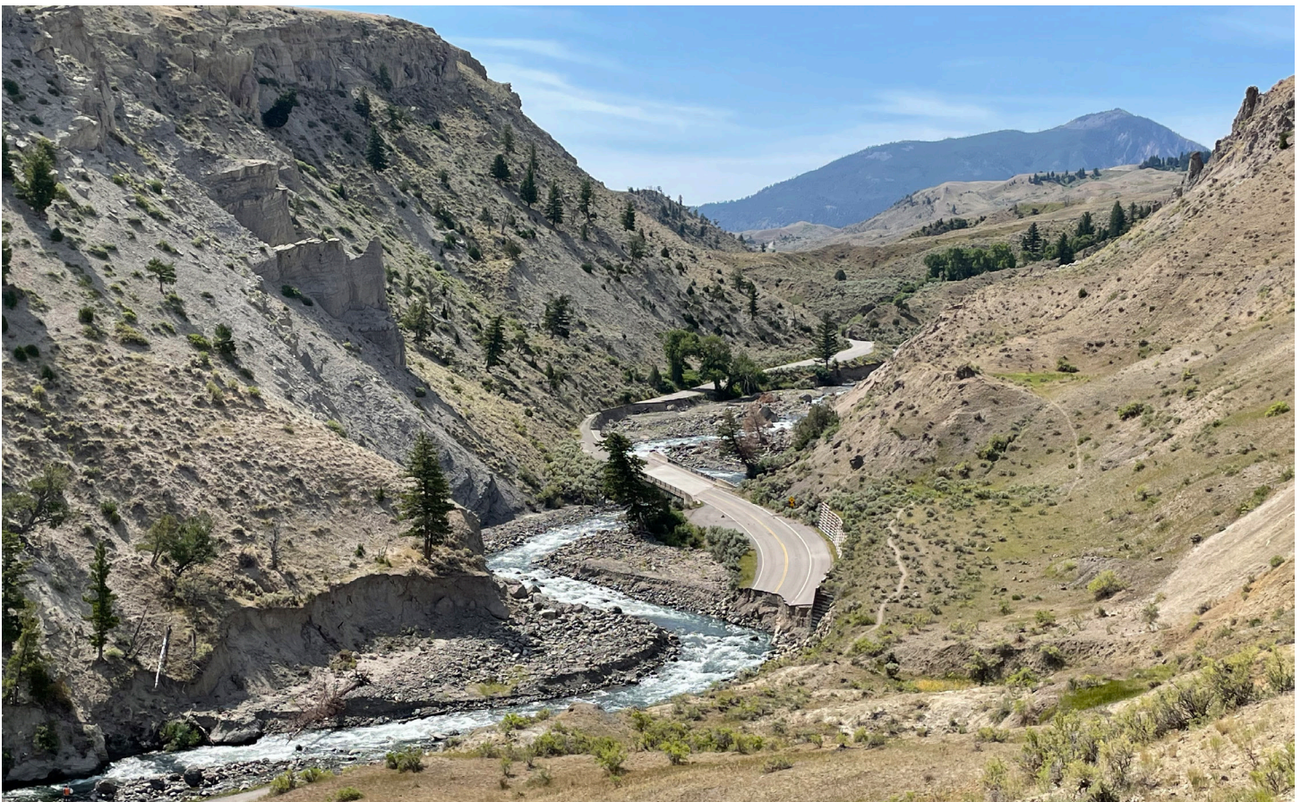
North Entrance Road