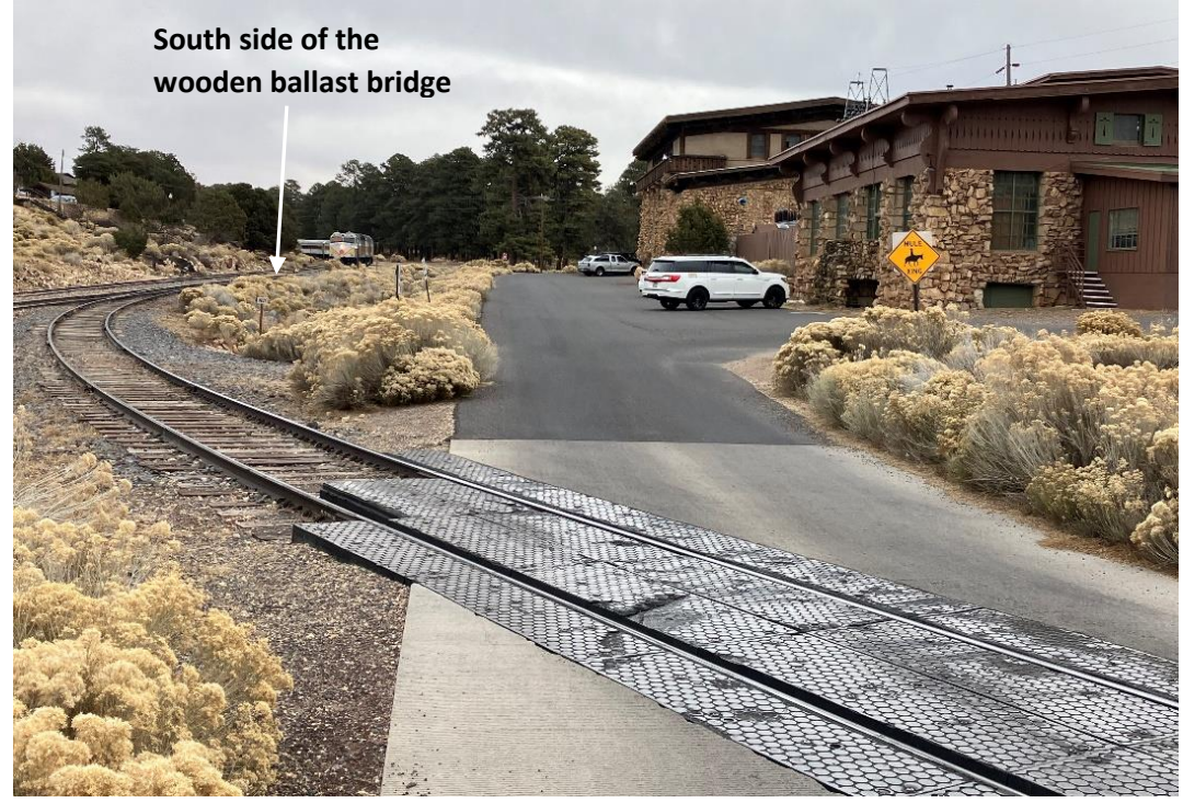
Image 4: An east facing view of the wooden ballast bridge location next to a service road. The power house, background, and engineering building, foreground, are to the right of the road. 1/3/2024