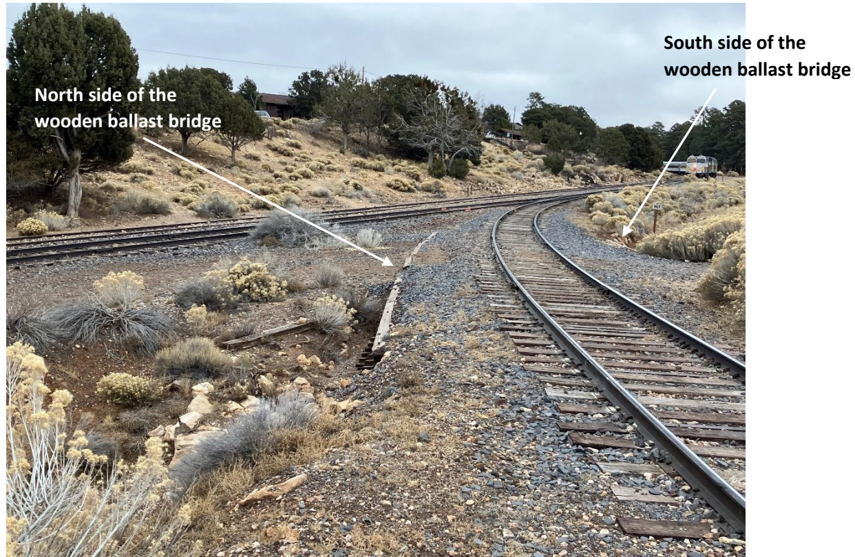
Image 3: A top view of the wooden ballast bridge from the railroad tracks. 1/3/2024