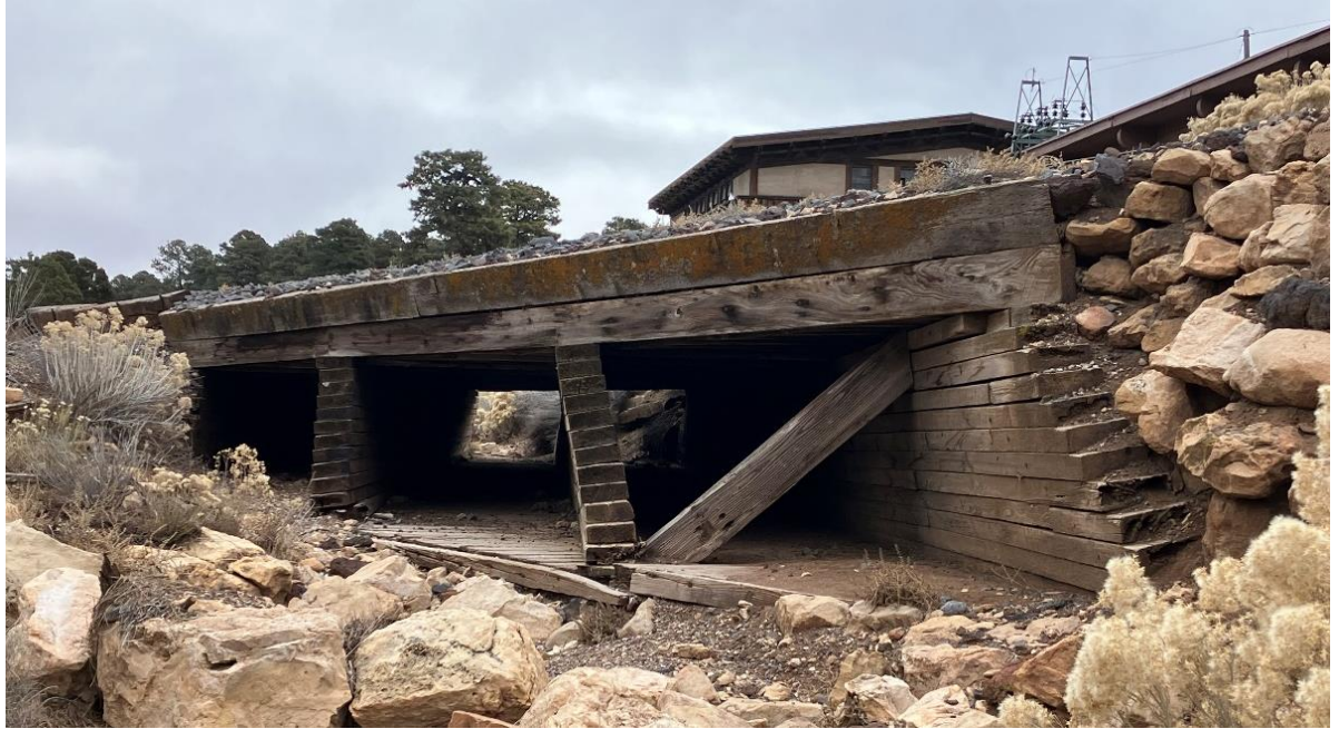
Image 1: A close-up view of the north side of the wooden ballast bridge. The roof of the power house is visible behind the bridge. 1/3/2024

Attachment: Wooden Ballast Bridge Photos Six Images