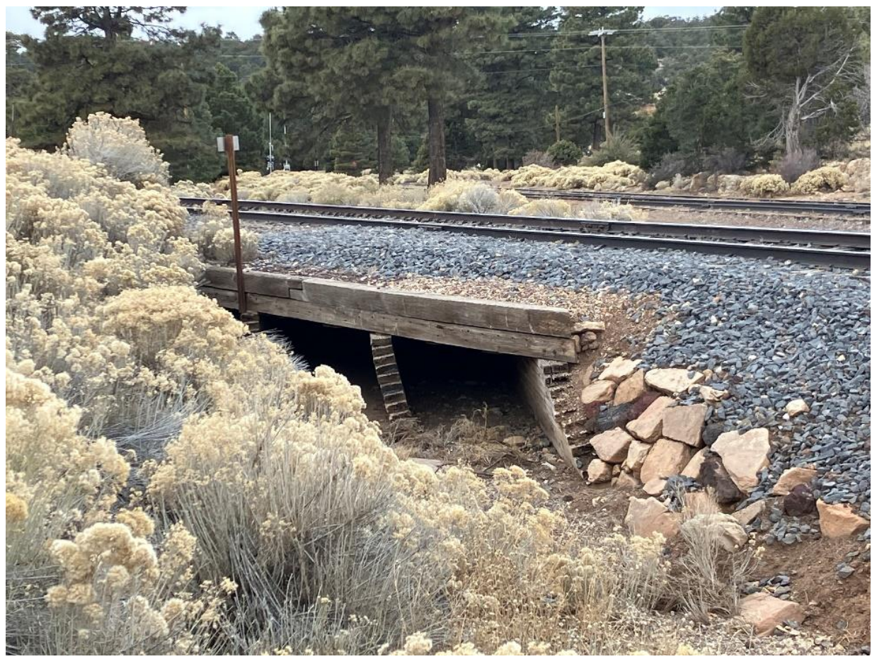
Image 5: A view of the south side of the wooden ballast bridge facing west towards the railroad tracks. 1/3/2024