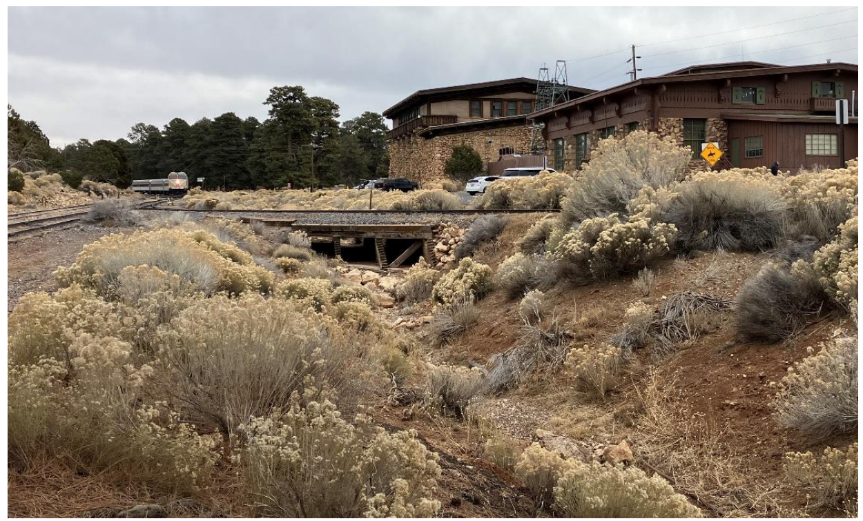
Image 2: A view of the north side of the wooden ballast bridge. The east facing view shows the railroad tracks and its vicinity to the power house, center, an engineering building, far right. 1/3/2024