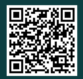
Scan for meeting link and to submit comments from December 18, 2023 until January 31, 2024!

The purpose of the virtual public meeting is to explain the project in more detail and allow the opportunity for the community to ask questions or voice any concerns. When you register at the meeting, questions will be collected and organized so our NPS staff can address as many as possible in the time allotted. There will be a presentation, which provides the purpose and need for the marina updates, describes the National Environmental Policy Act (NEPA) process and Environmental Assessment (EA) preparation, and presents a preliminary construction time frame. Following the presentation and formal Q&A, NPS staff will be available for additional questions.