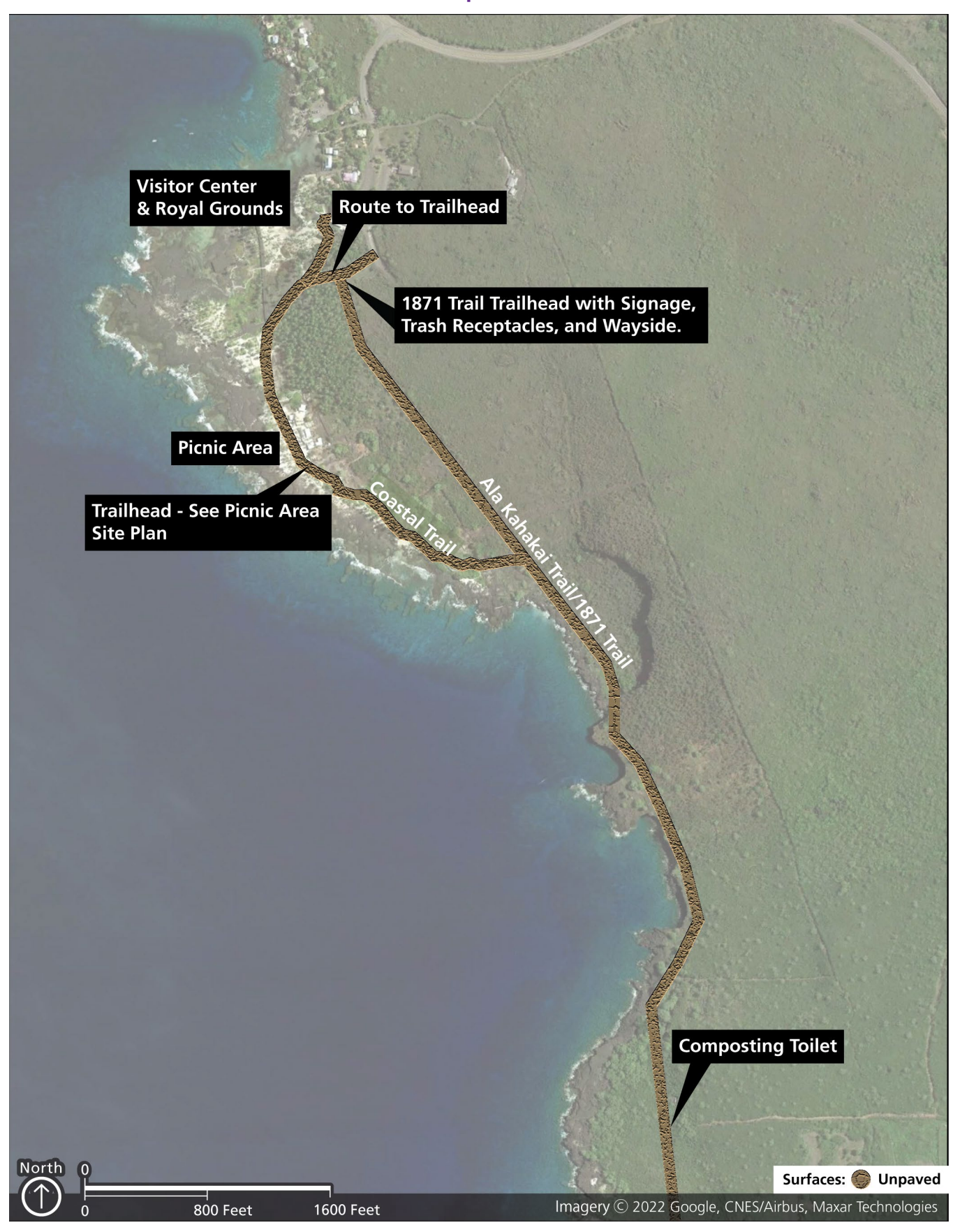
Trails Conceptual Site Plan