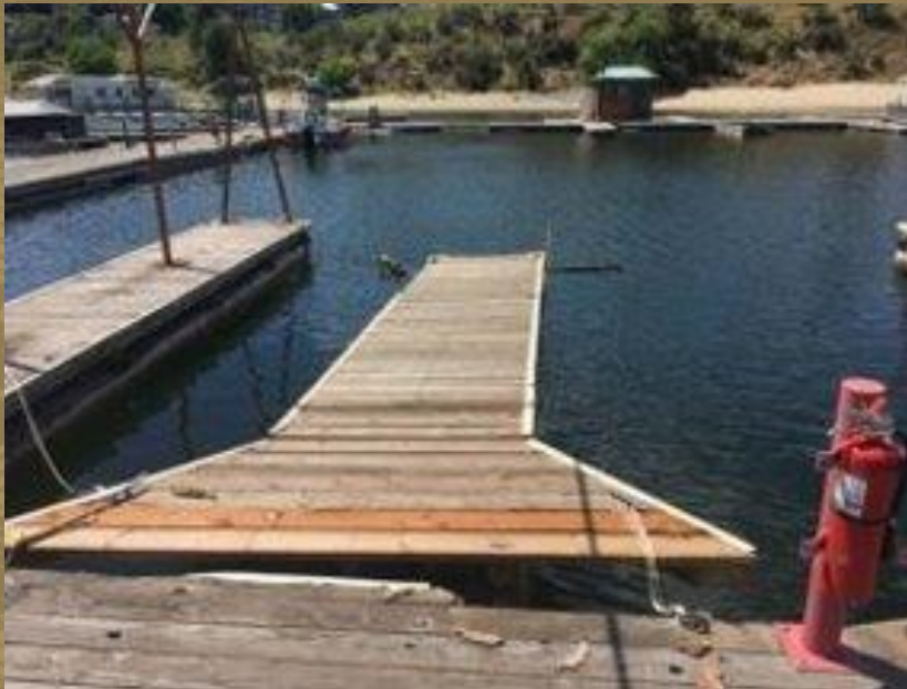
Damaged docks at Seven Bays Marina