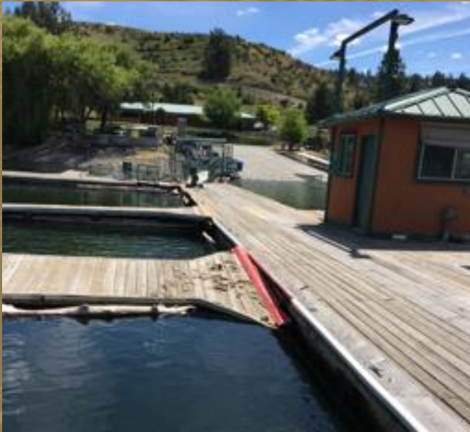
Seven Bays Marina

The current facilities at Seven Bays Marina are at the end of their life cycle.