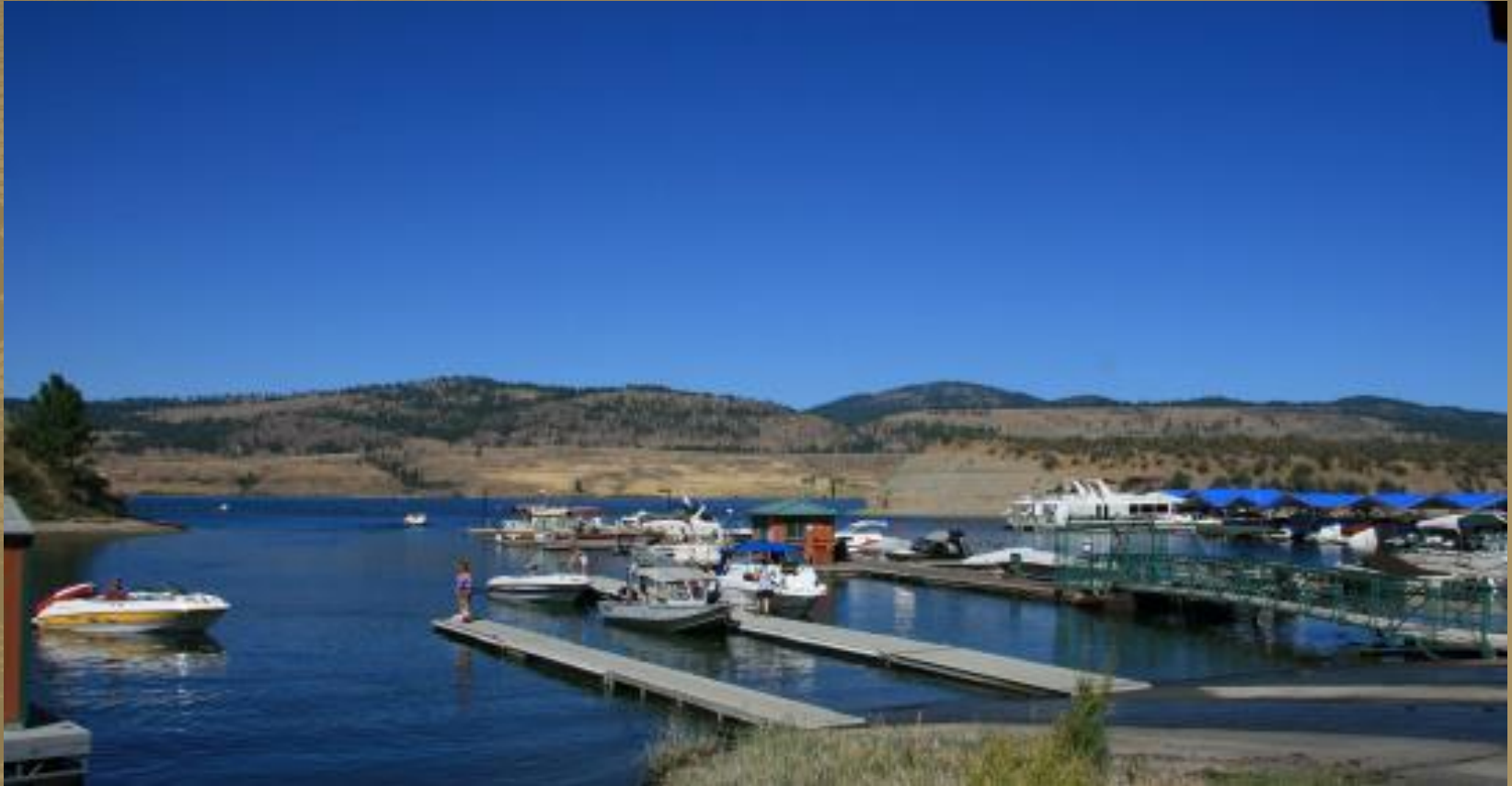
Lake Roosevelt National Recreation Area