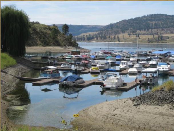
Seven Bays Marina