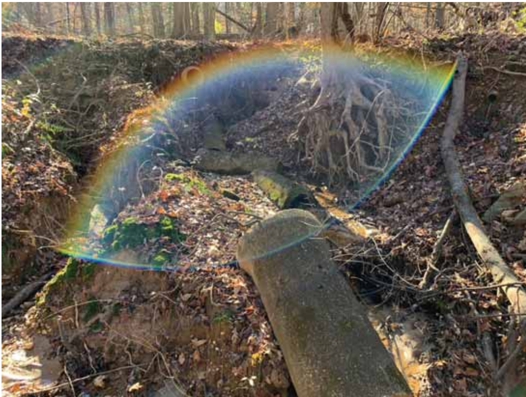
Photo 4: PA-04 – abandoning several small pipes in place at the head of gully