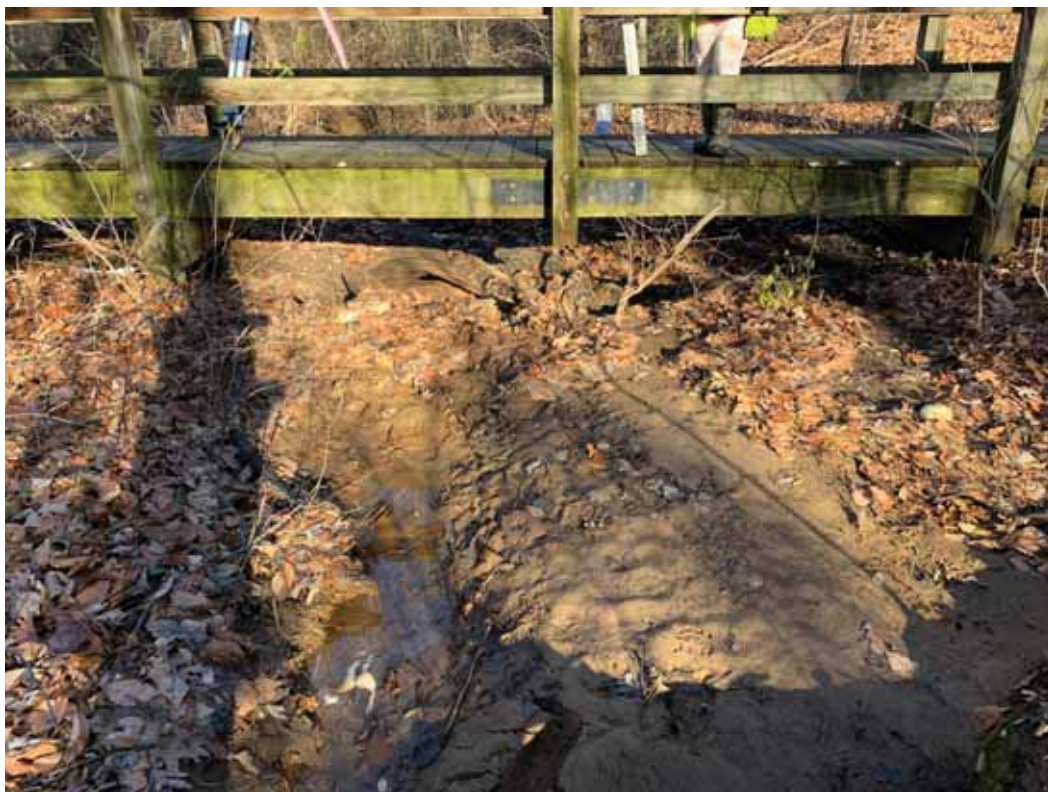
Photo 9: PA-08 – 2 wooden footbridges and an associated drainage pipes (24" RCP and twin 24" CMP) being removed/daylit and replaced with boardwalk