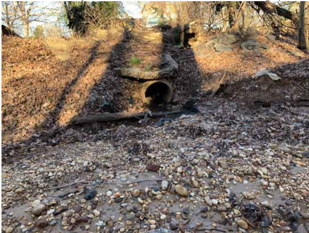
Photo 8: PA-06 – 24" reinforced concrete pipe (RCP) storm drain pipe being daylight in grass area upstream of Minnesota Ave and replaced with stormwater cell