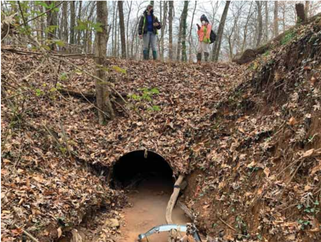
Photo 2: PA-01 – 42" corrugated metal pipe (CMP) culvert under NPS trail being removed/daylit