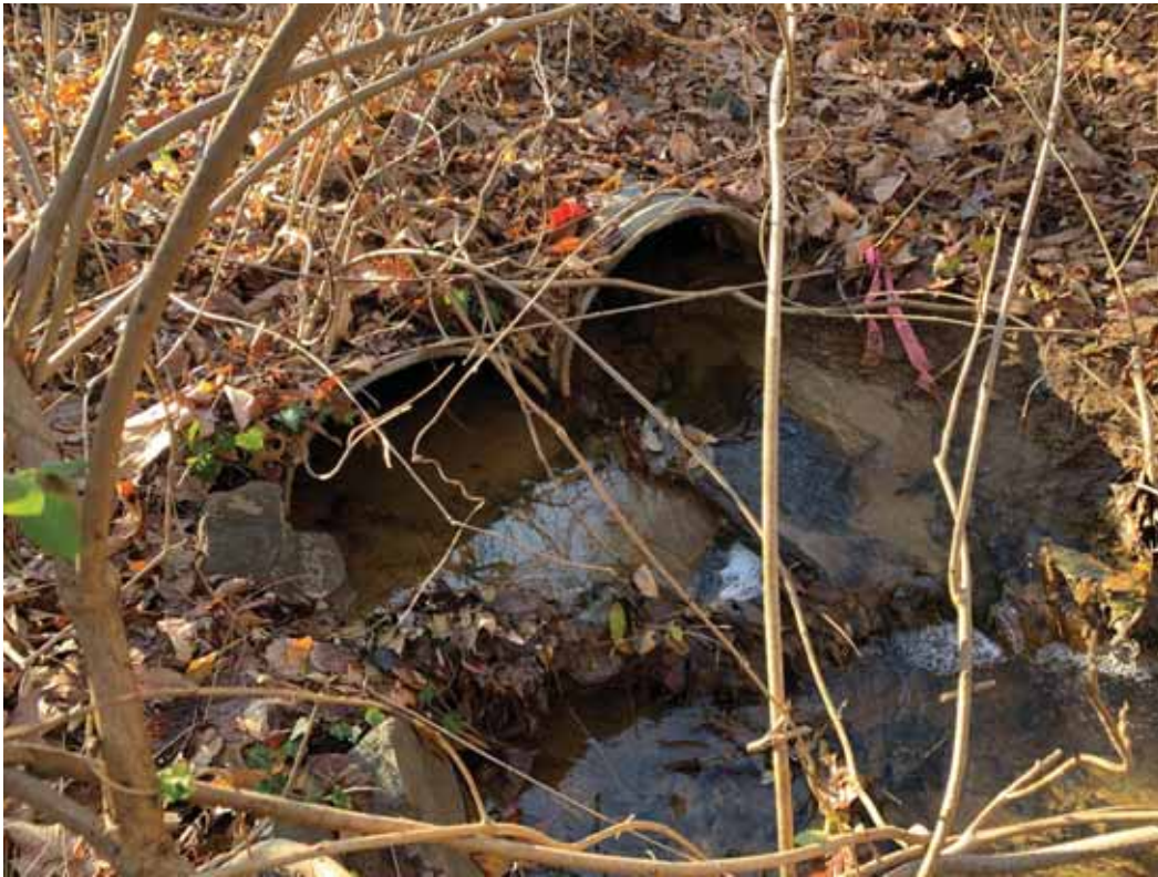
Photo 11: PA-08 – 2 wooden footbridges and an associated drainage pipes (24" RCP and twin 24" CMP) being removed/daylit and replaced with boardwalk