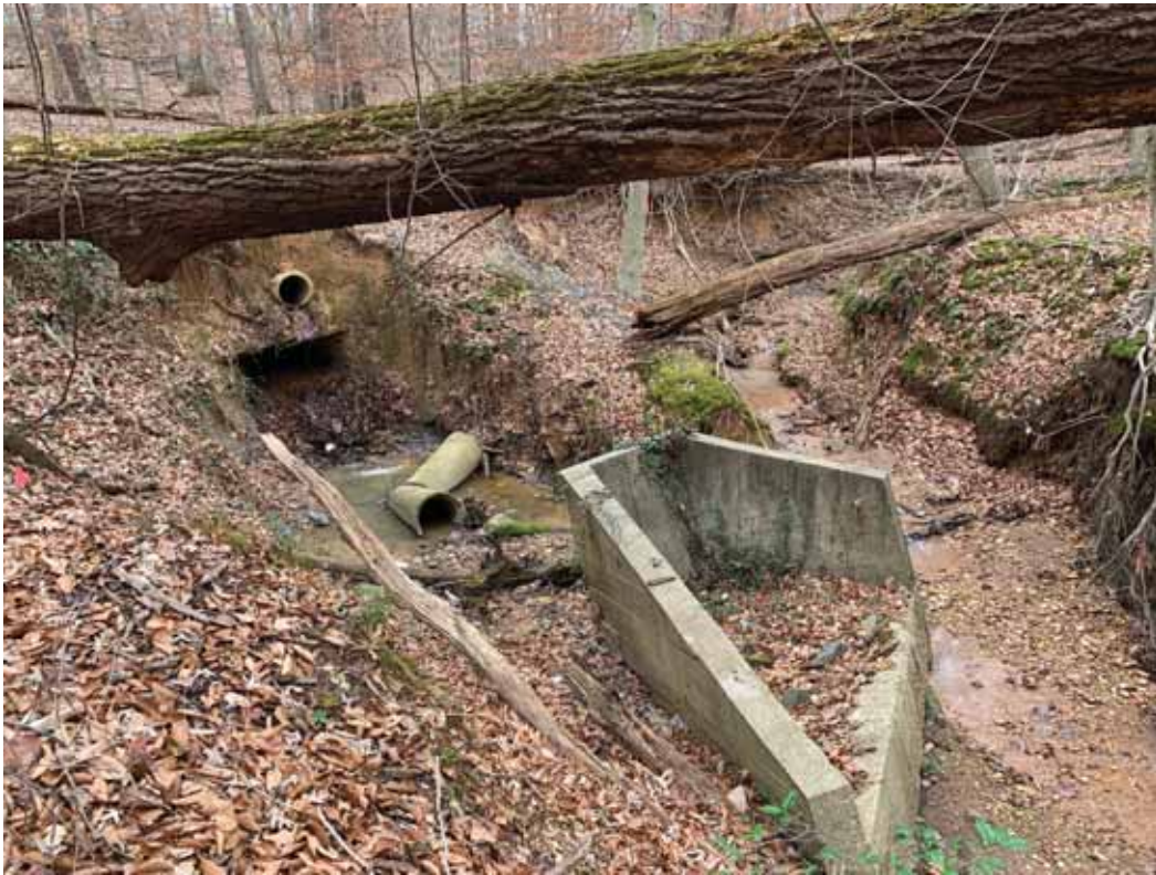
Photo 1: PA-01 – 18" reinforced concrete pipe (RCP) storm drain pipe being daylighted in wooded area and replaced with RSC