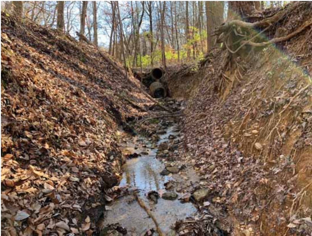
Photo 3: PA-04 – 36" reinforced concrete pipe (RCP) culvert under wooded area being removed/daylit