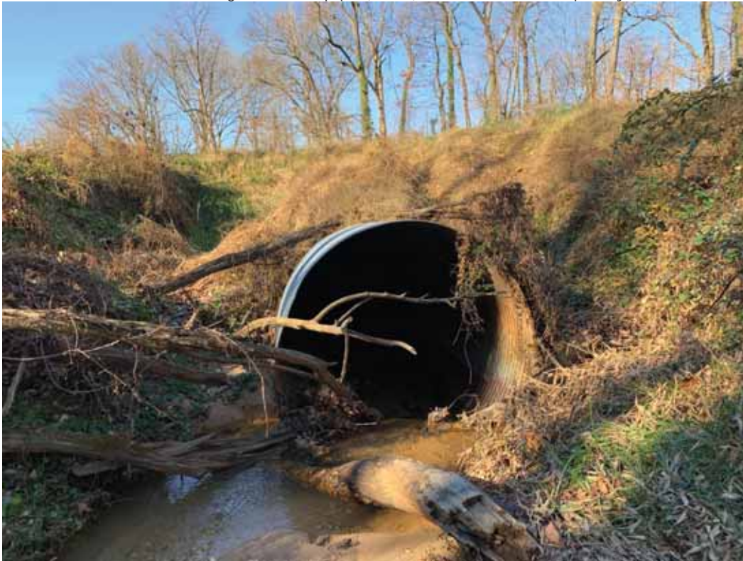
Photo 6: PA-05 – 84" corrugated metal pipe (CMP) culvert under footpath/lawn area being replaced