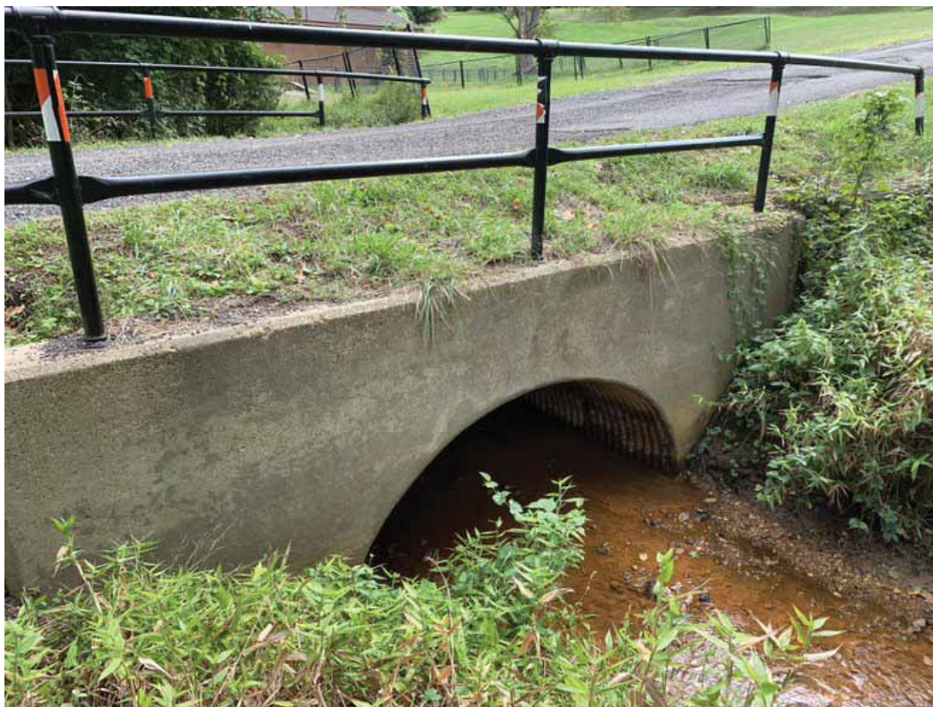
Photo 7: PA-06 – 8-ft by 5-ft concrete box culvert under NPS access road being replaced.