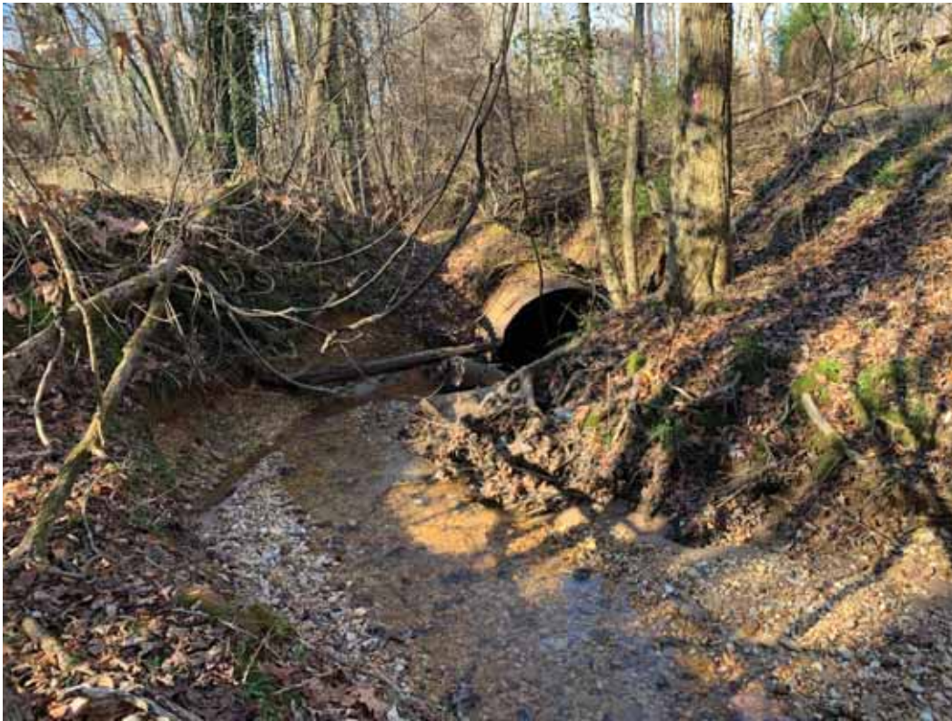
Photo 5: PA-05 – 66" corrugated metal pipe (CMP) culvert that is completely undermined and being removed/daylit