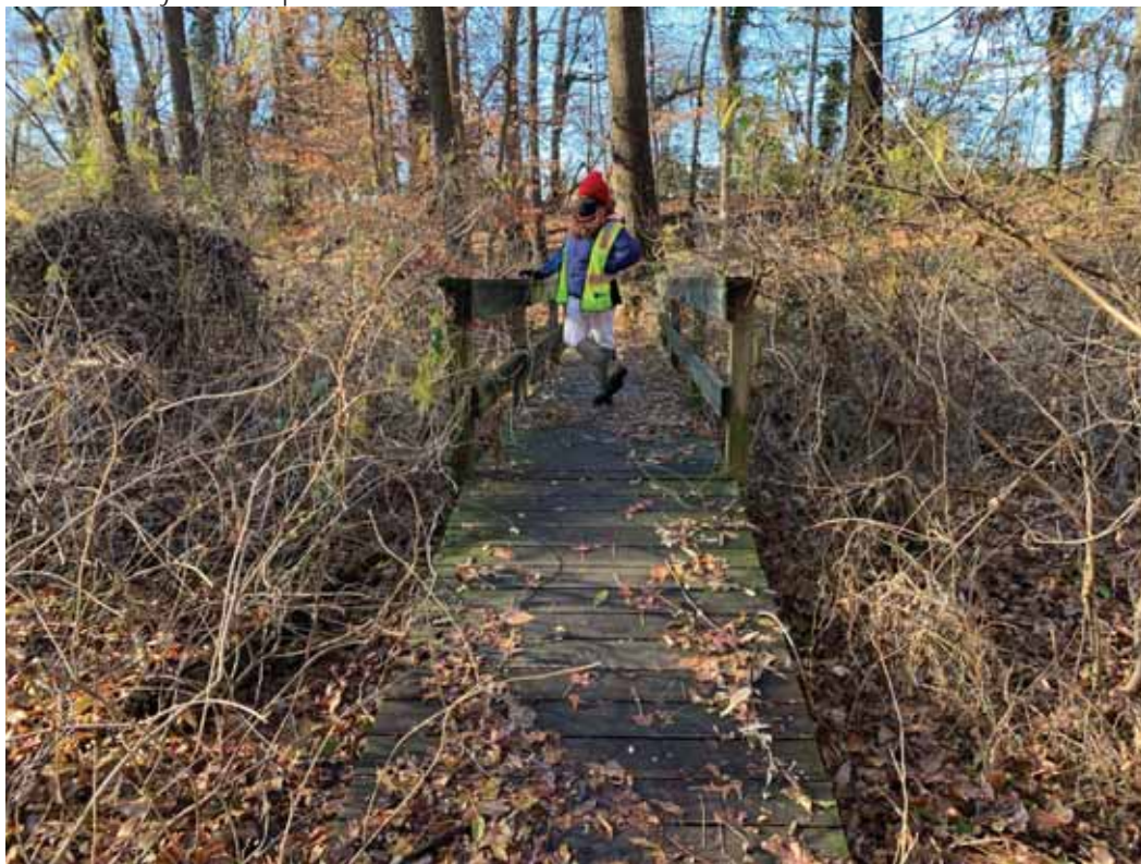
Photo 10: PA-08 – 2 wooden footbridges and an associated drainage pipes (24" RCP and twin 24" CMP) being removed/daylit and replaced with boardwalk