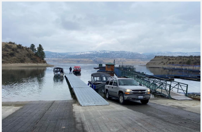
Figure 4. Seven Bays Marina Boat Ramp

The EA will also document the existing environmental conditions and potential impacts of implementing those actions carried forward for further review. The draft design plans and the EA will be presented for public review and comment. The EA is anticipated to be available for review by early spring 2024.