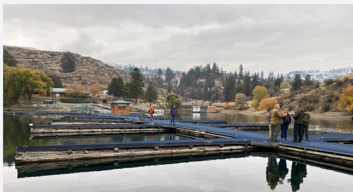
Figure 5. Seven Bays Marina floating docks

Thank you for your interest in the project to Rehabilitate Seven Bays Marina!