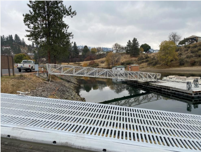
Figure 3. Gangway leading to the houseboat dock.