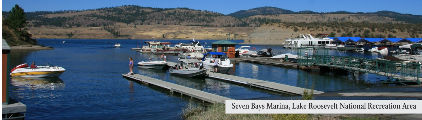
Seven Bays Marina, Lake Roosevelt National Recreation Area

Lake Roosevelt National Recreation Area invites you to participate in the planning and development of the Seven Bays Marina improvement project. The current facilities at the Seven Bays Marina are at the end of their life cycle. This project will focus on needed improvements to site amenities, including replacing the existing dock system, improving traffic flow (pedestrian and vehicles) and parking,