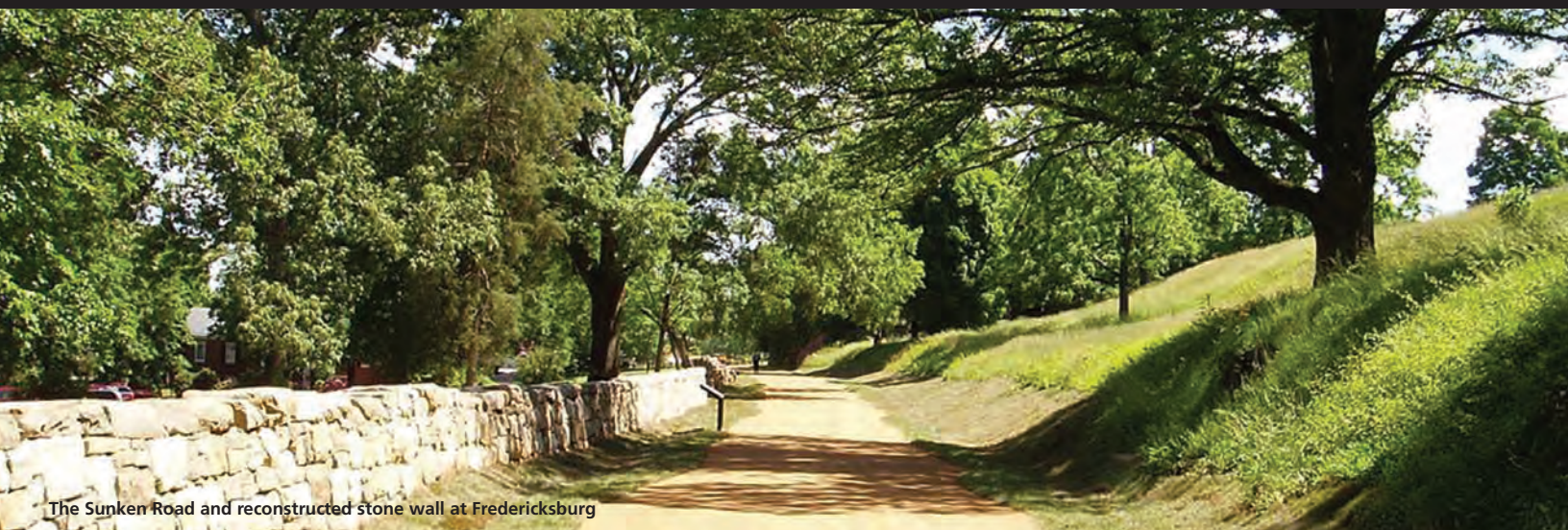
The Sunken Road and reconstructed stone wall at Fredericksburg