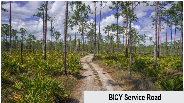
BICY Service Road

BICY encompasses over 720,000 acres of swamplands, flatwoods, and estuarine wetlands. It is home to a myriad of plants and animals, including many rare, endangered, and threatened species. BICY has one of the most active fire programs in the NPS.