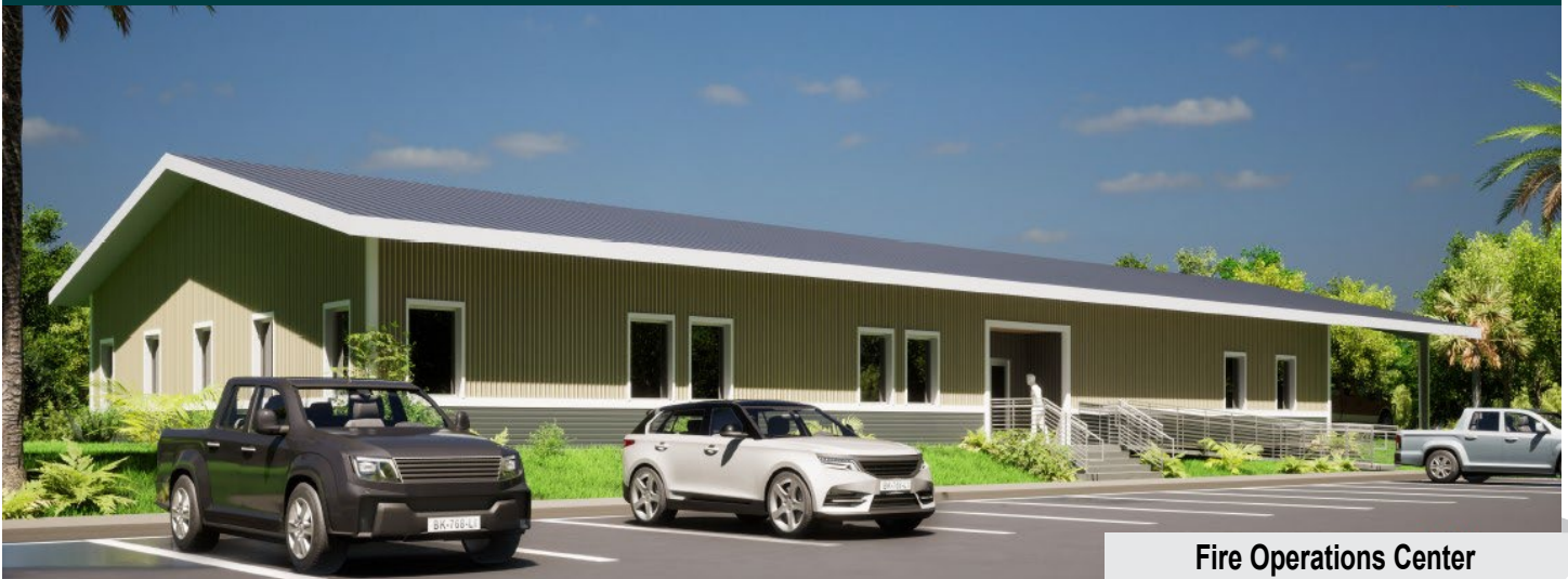
Fire Operations Center

The National Park Service (NPS) is proposing to update and increase the efficiency of the Big Cypress National Preserve (BICY) Fire and Aviation Program by constructing a modern, safe, and efficient Fire Operations Center (FOC). The new FOC and associated facilities will be constructed in a centralized location near the BICY Headquarters Complex in Ochopee, FL. The project will address the current inadequacies of the fire facilities. A new streamlined FOC will be instrumental in helping NPS meet its annual goal of >125,000 acres of prescribed fire in BICY.