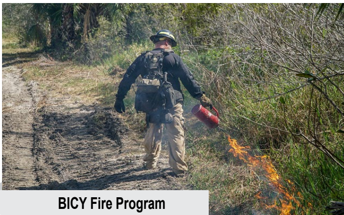
BICY Fire Program

The BICY Fire and Aviation Program currently operates out of three locations across BICY, making coordination and operations inefficient. The buildings were constructed in the 1970s and are inadequate for today's fire operations. These facts underscore the need for an updated and efficient Fire Operations Center and associated facilities. The purpose of this project is to support the park's expanding Fire and Aviation Program to reduce the severity and extent of wildfires and to enhance the health and quality of the ecosystems within BICY.