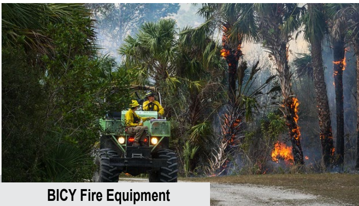
BICY Fire Equipment

The National Environmental Policy Act (NEPA) requires all federal agencies to consider and document the potential impacts of management actions on the human environment. The NPS Organic Act of 1916 directs NPS to both conserve park resources and provide for their use and enjoyment. Both Acts are used by NPS to plan and make informed decisions that help protect park resources and values.