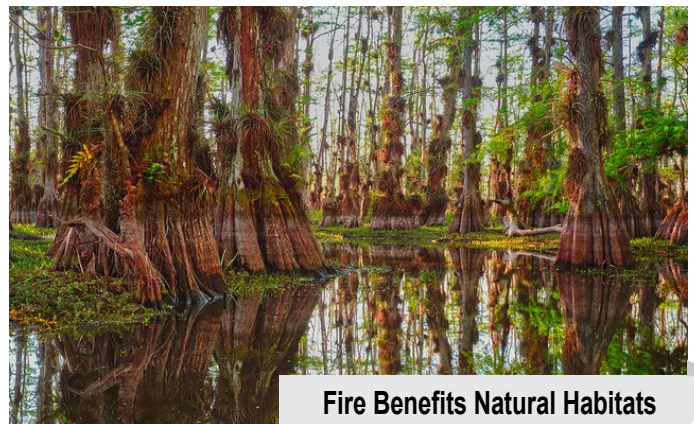
Fire Benefits Natural Habitats