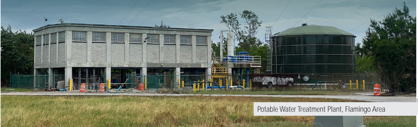
Potable Water Treatment Plant, Flamingo Area

The National Park Service is beginning the Everglades (EVER) Rehabilitation of Parkwide Water and Wastewater Systems project. This project focuses on the need to improve and/or replace potable water treatment and distribution systems, and wastewater collection and treatment systems at key areas across the park. Those areas include Shark Valley, Loop Road, Main Entrance/Royal Palm, and Flamingo. The existing systems are critically deficient, expensive to maintain, and many are only partially operable or at the end of their service life.