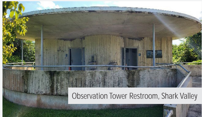
Observation Tower Restroom, Shark Valley

Thank you for your interest in the Rehabilitation of Parkwide Water and Wastewater Systems project!