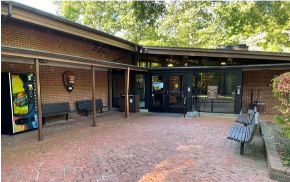
Entrance to the Chancellorsville Visitor Center showing four of the six benches.