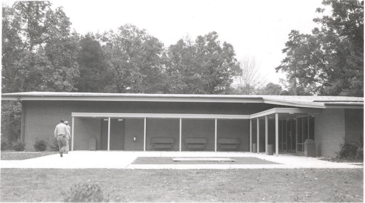
The north elevation of the Chancellorsville Visitor Center showing three original benches located under the porch overhang, circa 1963. One of the benches was later removed – date unknown – and only two remain at this location today (although of a different design).