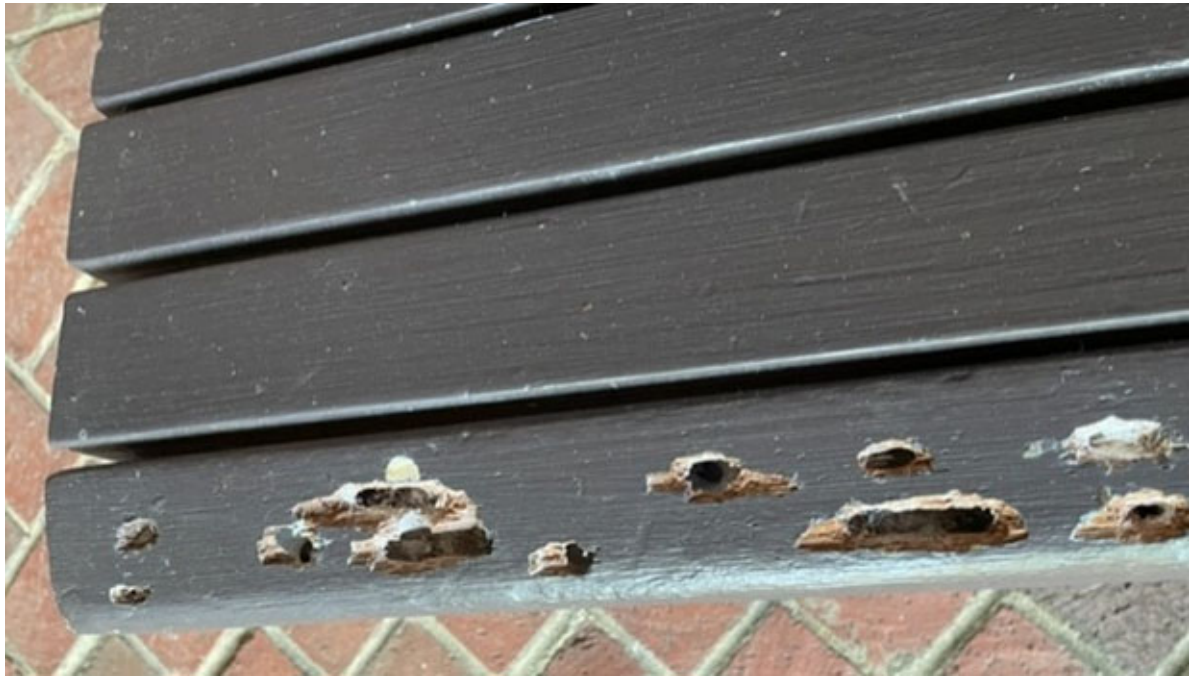
A close-up of the damage.