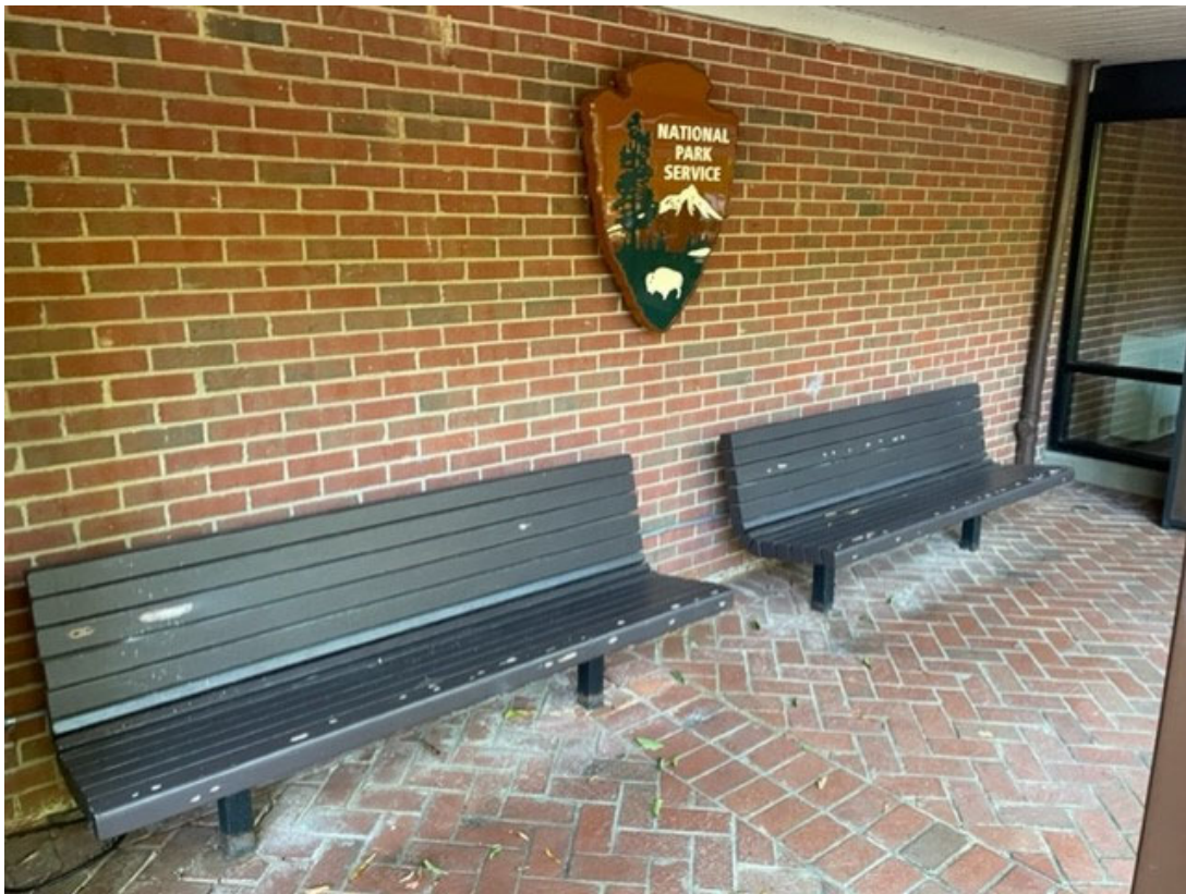
The two benches outside the main entrance and under the porch overhang show extensive carpenter bee/woodpecker damage on multiple wooden slats.