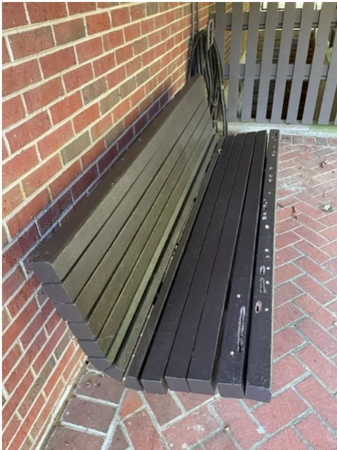
A stand-alone bench near the basement stairs also showing extensive damage.