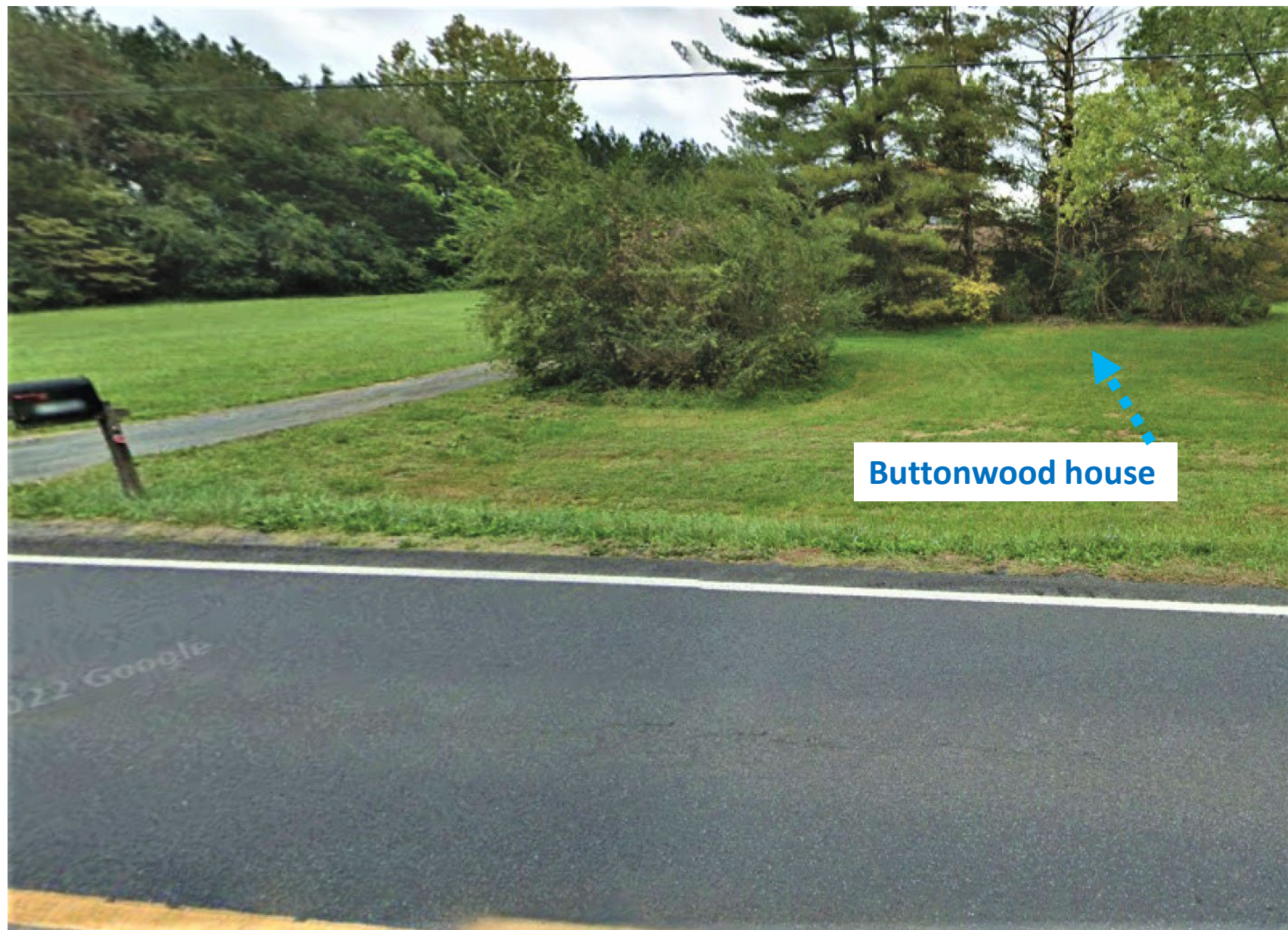
Buttonwood House: Visual Screening from Va. Rt. 22, Looking South