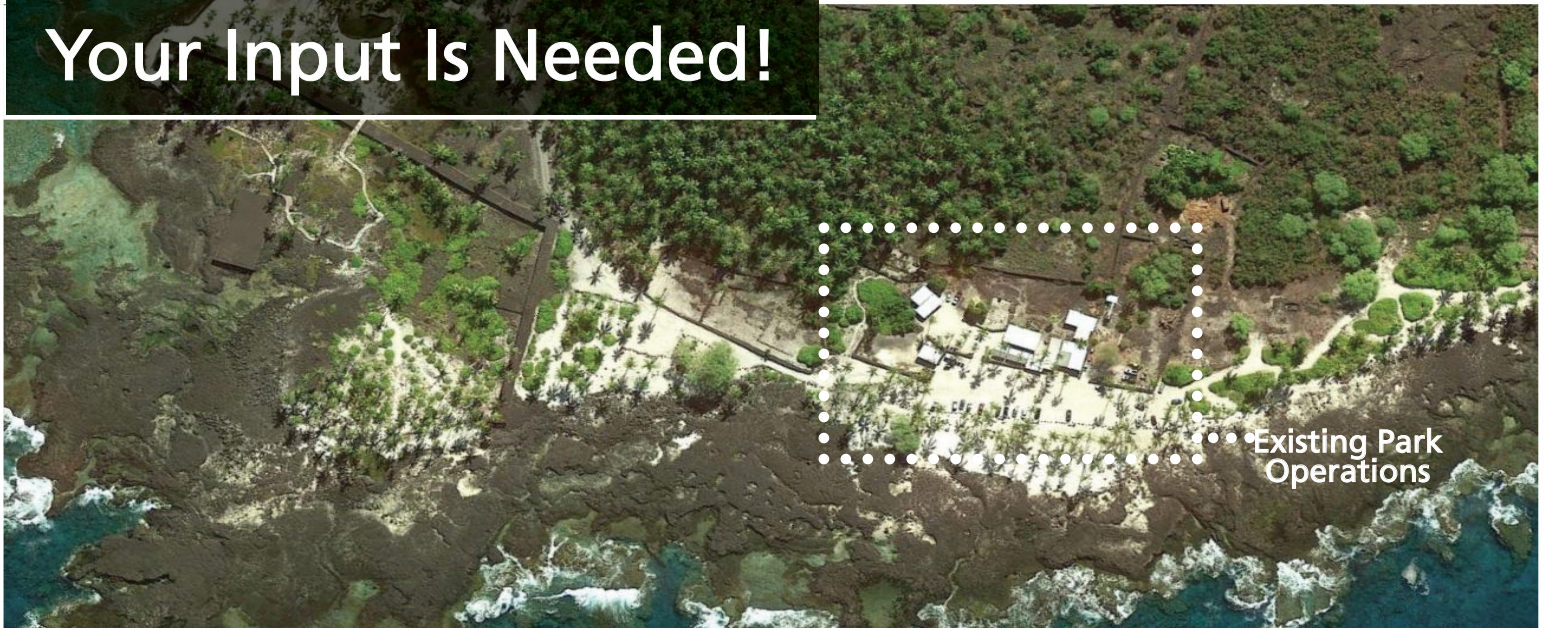
Aerial view of Pu'uhonua o Hōnaunau National Historical Park maintenance facilities.