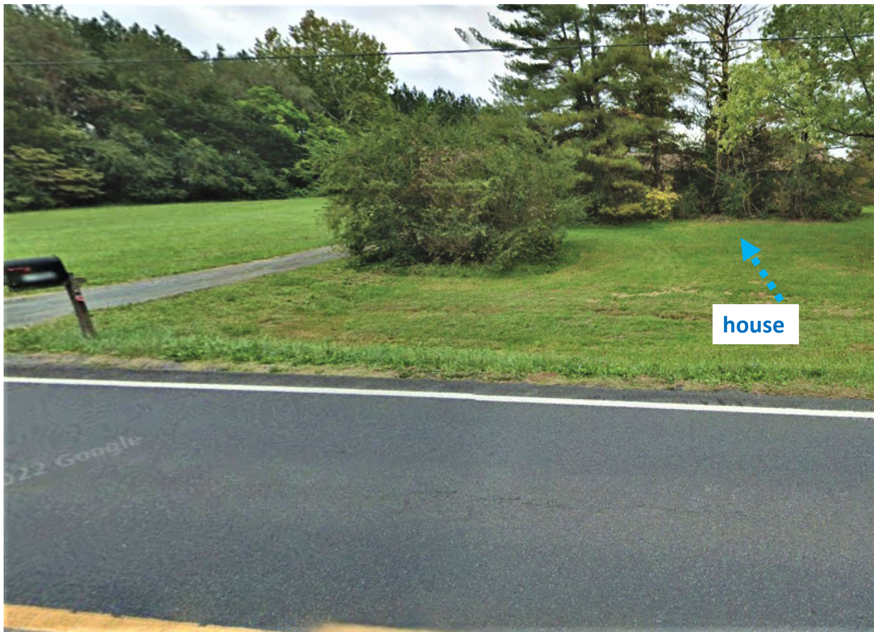
Buttonwood House: Visual Screening from Va. Rt. 22, Looking South