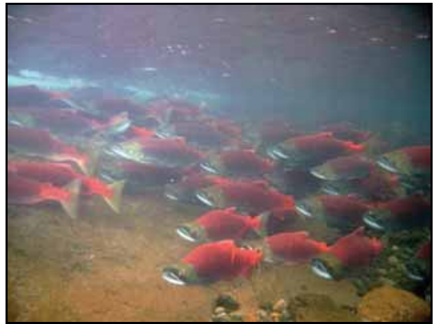
Sockeye salmon turn red when they reach the end of their lifecycle.

The salmon runs of Bristol Bay, including those from rivers that originate in Katmai National Park and Preserve, serve as a laboratory for progressive fisheries management.