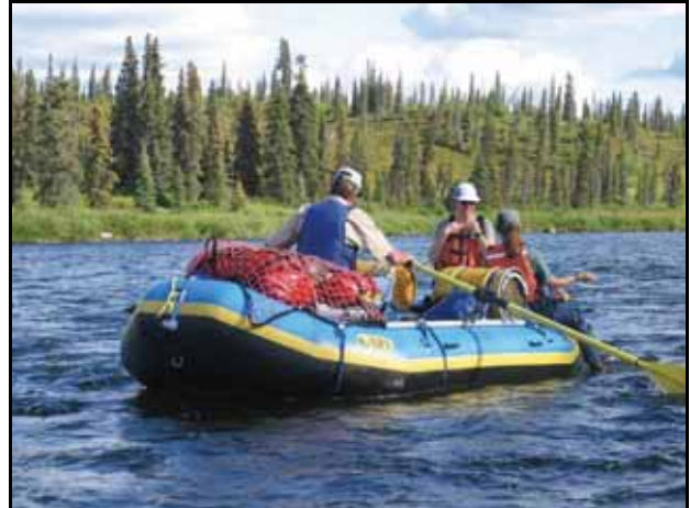
Katmai National Park and Preserve is known for its exceptional recreational floating opportunities.