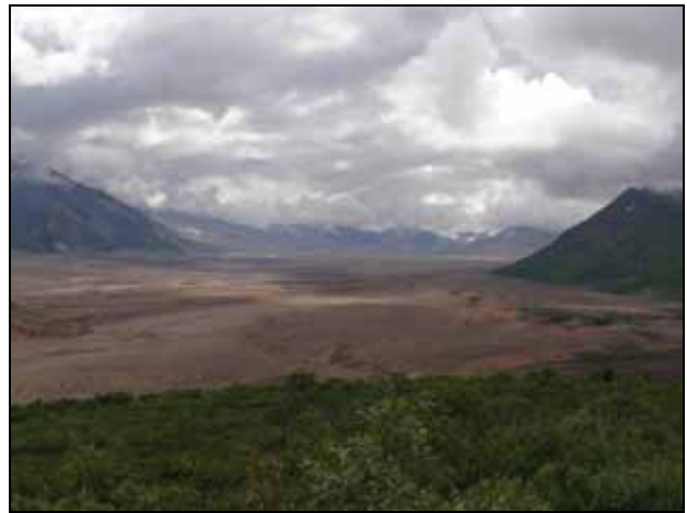
The Valley of Ten Thousands Smokes has played an important role in volcanology for many decades.

The eruption of 1912 contributed to the abandonment of several native villages which were never re-established. The park works to study and record the ongoing cultural history associated with these sites.