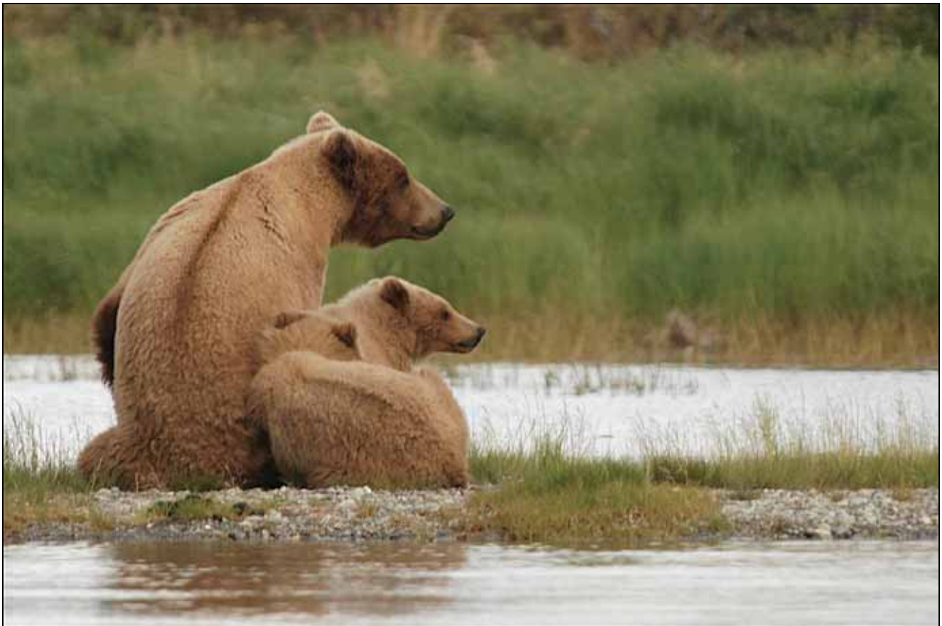
A family of Katmai National Park and Preserve's iconic brown bears rests near Brooks Camp.