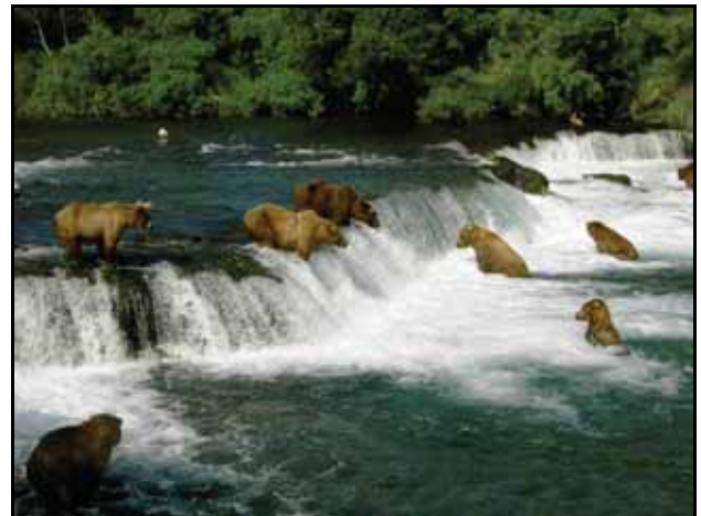
Katmai National Park and Preserve is one of the best places in the world to view brown bears.