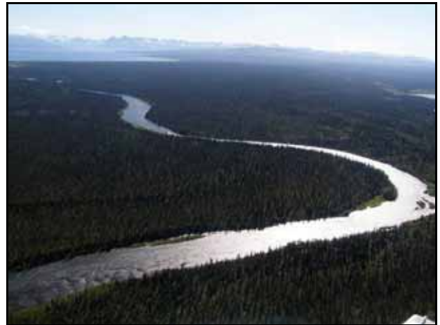
The Alagnak Wild River is one of the Bristol Bay region's most popular tourist destinations.