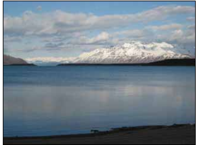
The lakes and rivers of Katmai National Park and Preserve have served as the foundation for life in the region for thousands of years.

The park preserves watersheds that have provided important travel corridors and defined territories sustaining populations through time.