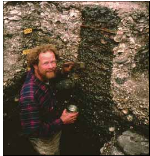
A 1500 year record of intertidal and marine resource use is preserved in an archeological site in Amalik Bay.

The Park provides opportunities for local rural residents to engage in customary and traditional subsistence uses.