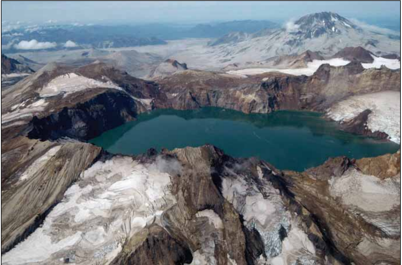
Katmai Caldera with Mt. Griggs in the background.

Appendix B includes legislation that, while superseded by ANILCA, offers contextual background information regarding the establishment of Katmai National Park and Preserve.