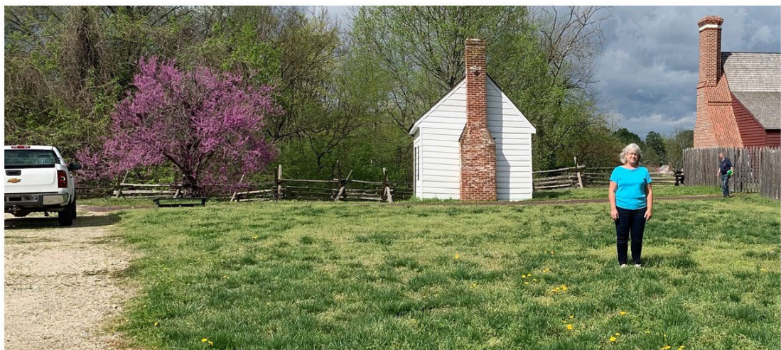
View to West: Proposed Archaeological Investigation (figure at right foreground)