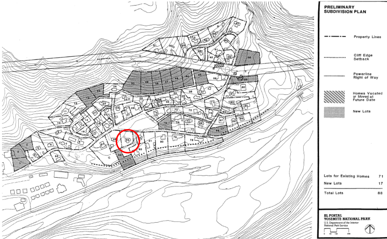
Old El Portal – 5564 Foresta Road, Lot #86