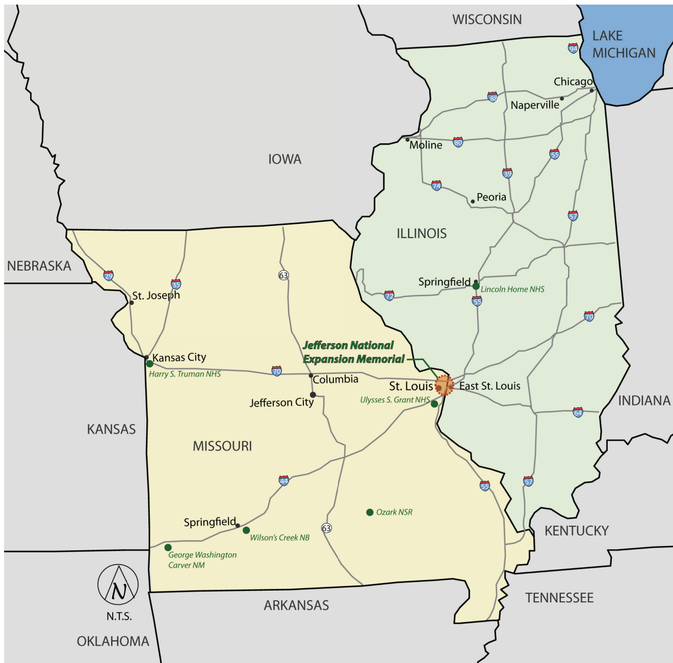
Figure 1.1 Jefferson National Expansion Memorial Region