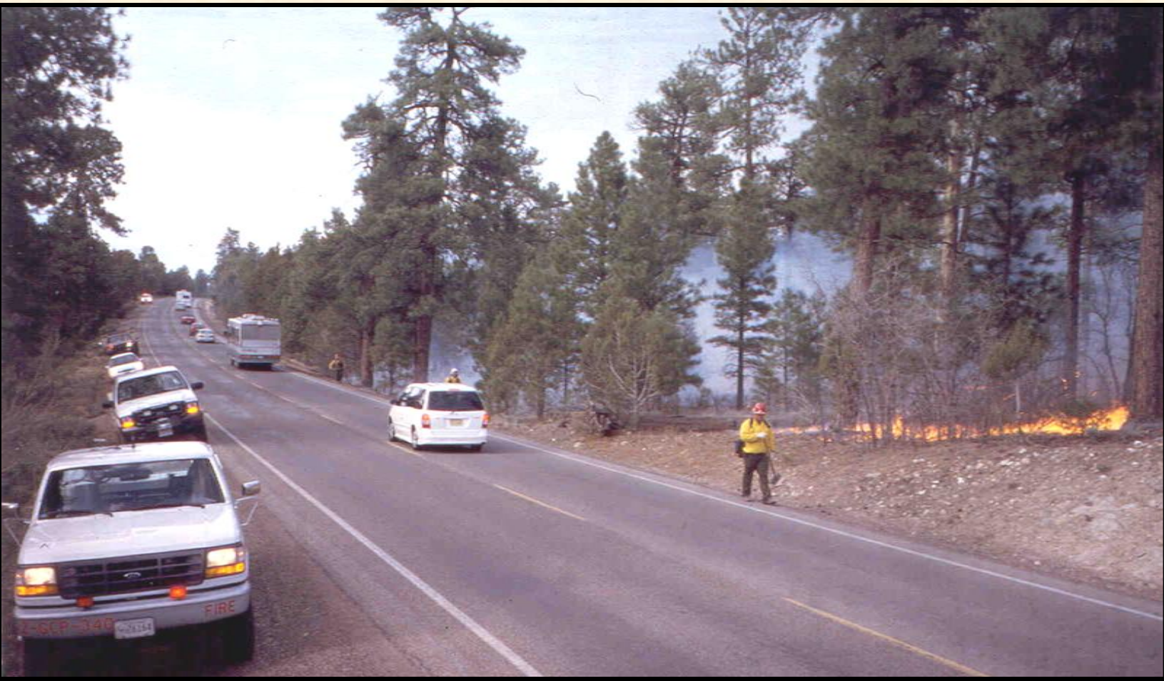
A low-intensity prescribed fire on the South Rim helps to reduce fuels, thereby lessening the threat of unwanted wildland fire in the developed area.

At Grand Canyon National Park, several methods are approved under the current Fire Management Plan for reducing threats to the wildland/urban interface from wildland fire. These include thinning trees around developed areas, creating breaks in the wildland fuels adjacent to structures, prescribed burning, or a combination of these strategies.