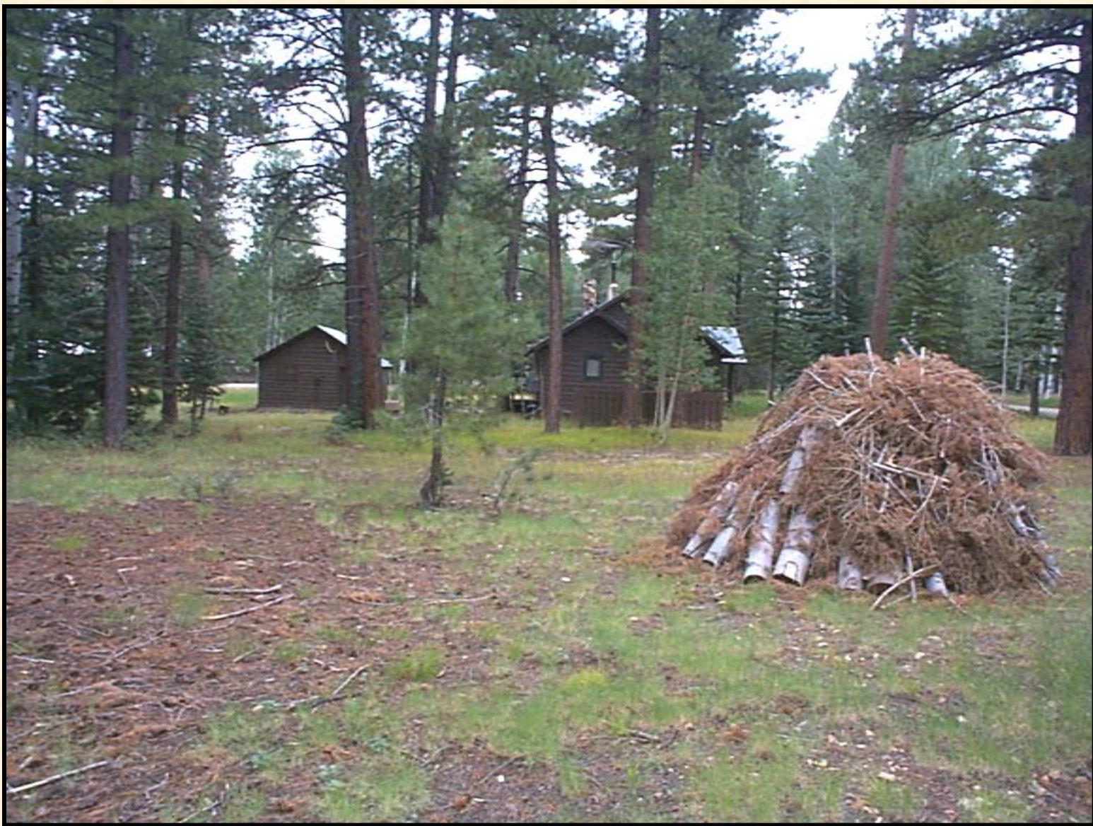
Brush piles in the North Rim developed area from the on-going Bright Angel thinning project. Excess fuels are removed from developed areas, piled, and burned when conditions are favorable.