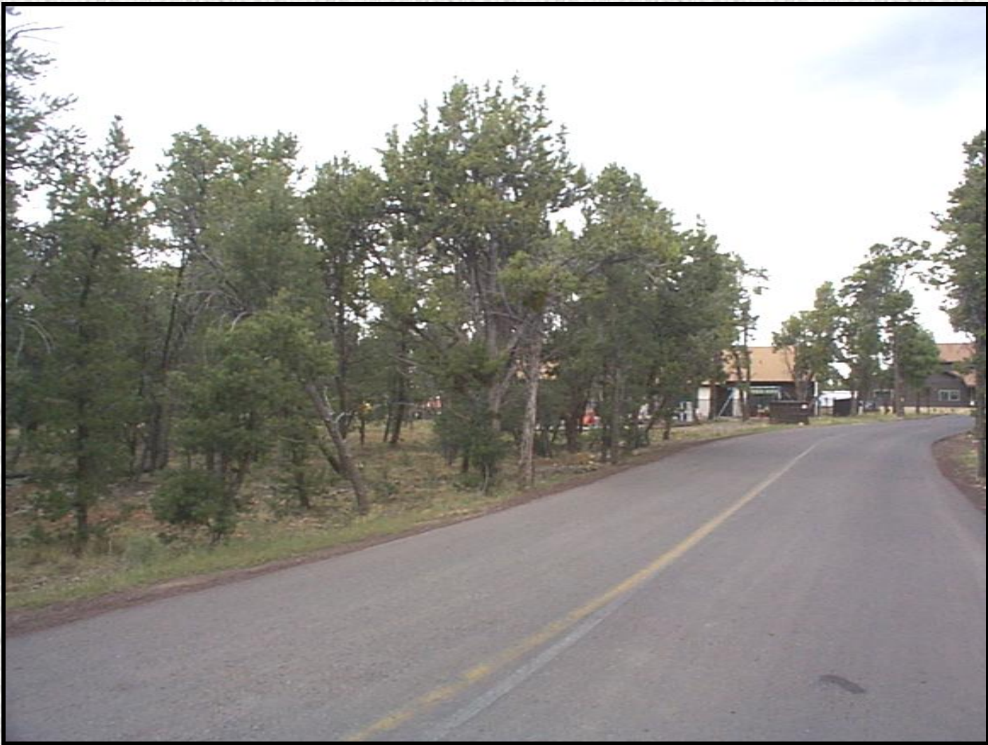
Several projects are planned to mitigate the potential wildland fire hazard in these areas.

The Park's South Rim Village, North Rim developed area, and Desert View communities are all identified as at risk from the threat of wildland fires in the Federal Register, Volume 66, #160, dated August 17, 2001.