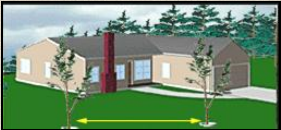
Thinning trees and other wildland fuels