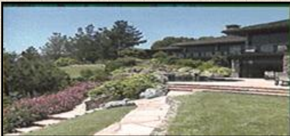
Establishing breaks in continuous fuels