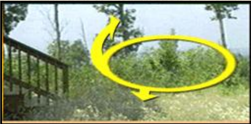
Removing lower limbs and brush that can serve as ladders to carry fire into treetops