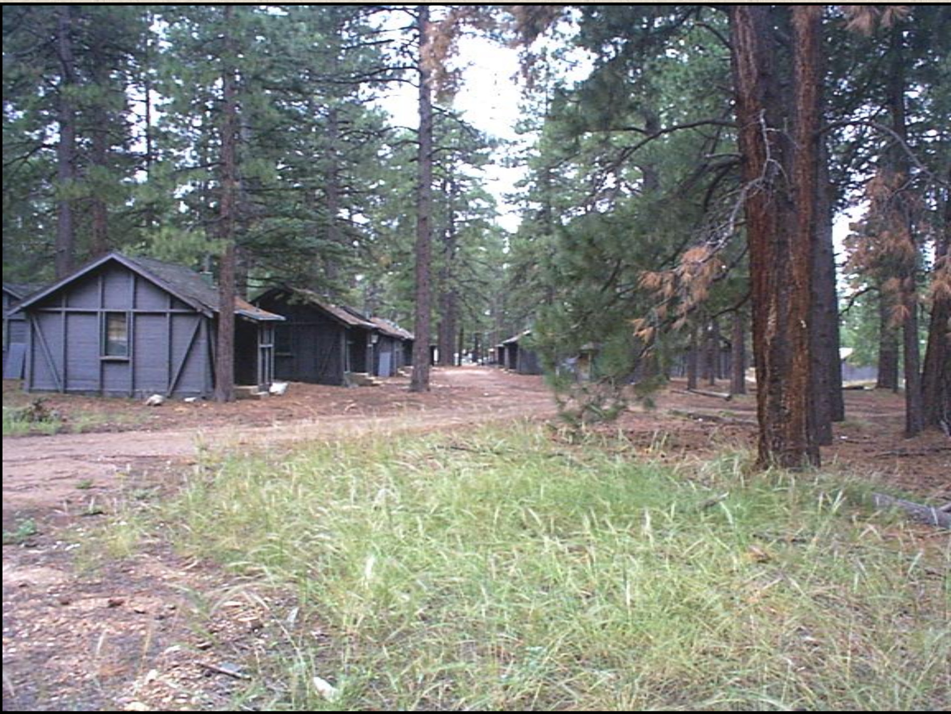
What is Wildland/Urban Interface?

The term Wildland/Urban Interface (WUI) is used to describe any area where potentially dangerous combustible wildland fuels are found adjacent to combustible homes, other structures, or transportation corridors.