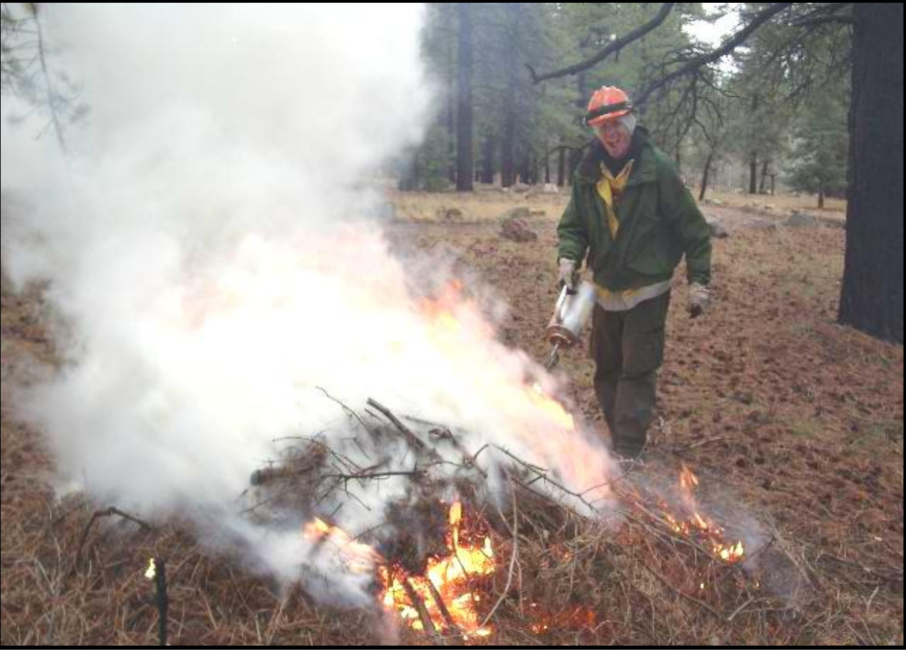
Fall 2002 burning of brush piles created during the Bright Angel thinning project.

As communities and urban developments continue to expand around Grand Canyon National Park, fire and fuels management within the wildland/urban interface is becoming a critical component of the fire management plan.