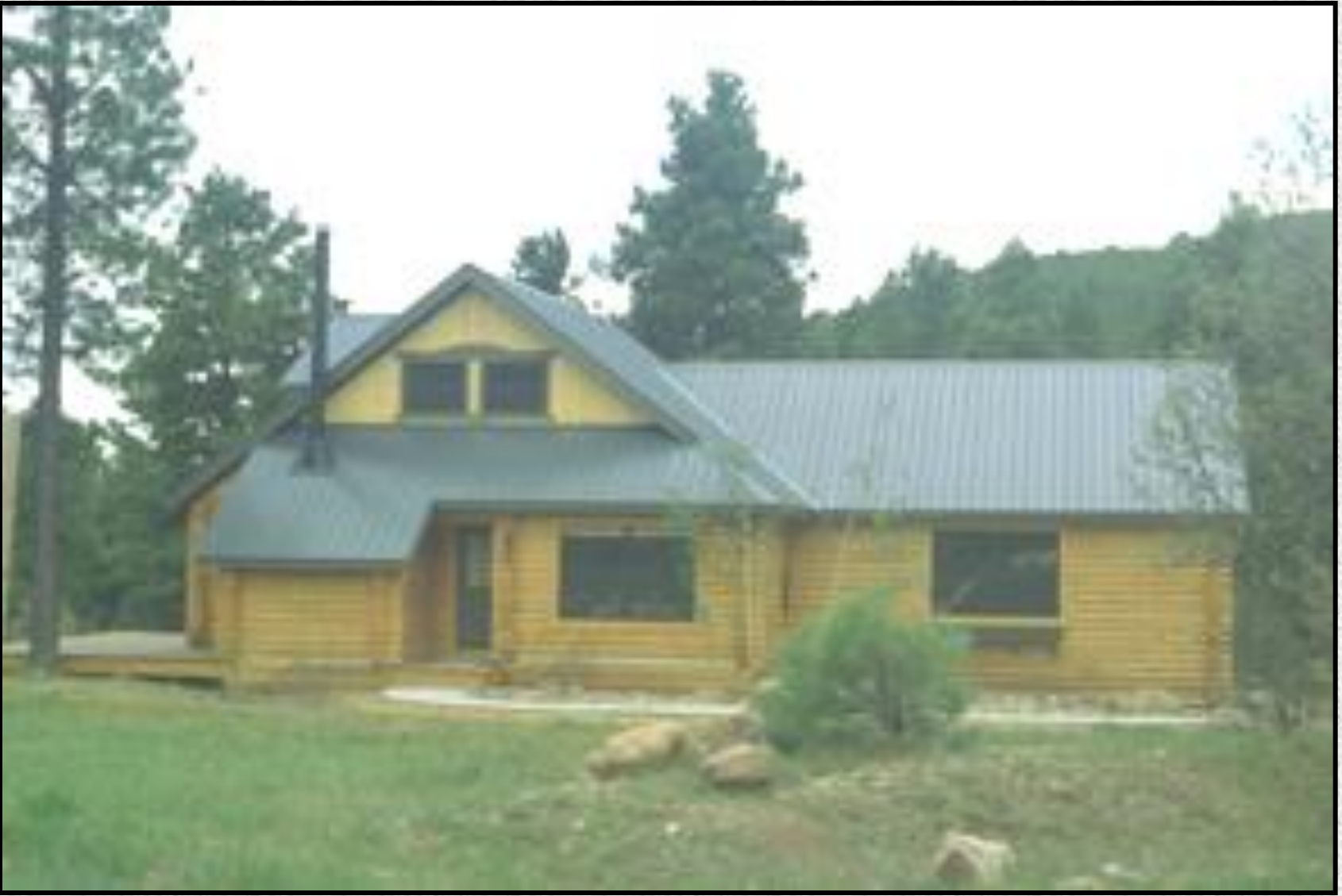
Firewise ( www.firewise.org ) offers educational information for people who live or vacation in fire prone areas of the United States.

Firewise is a program sponsored by the National Wildfire Coordinating Group (NWCG). Members of the NWCG, including the Department of Interior, are responsible for wildland fire management in the United States. NWCG's Wildland/Urban Interface Working Team directs the Firewise program.