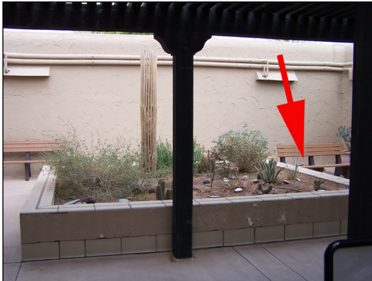
Photo 3: Location of test pit in Visitor Center Atrium Area (approximately 4 feet by 4 feet).