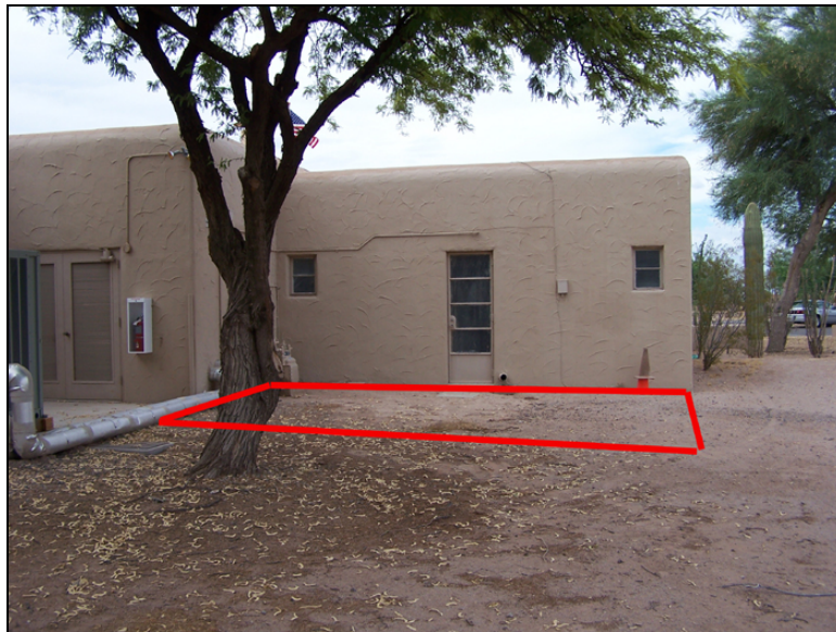
Photo 2: Area on east side of Visitor Center behind exiting Restrooms (approximately 39 feet by 22 feet). Approximate boundary of assessment is identified in red.