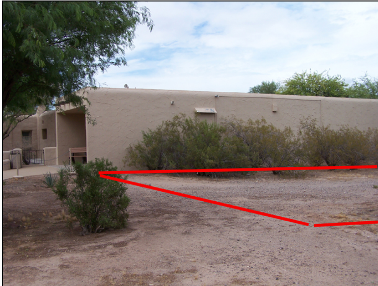
Photo 1: Area on south side of Visitor Center (approximately 67 feet by 48 feet). Approximate boundary of assessment is identified in red.

Photograph(s) for the proposal should exhibit the area prior to project implementation, show the entire project, be suitable for compliance documentation, and should be relatable to the project map. Use as many photographs as necessary to adequately describe and evaluate the project.