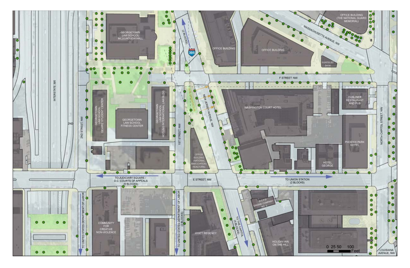
Figure 4-2: Massachusetts Avenue Site Study Area Land Uses

Under the No Action Alternative, a site for the placement of the Ukrainian Genocide Memorial would not be selected at this time. The positive impact expected from designating a site for the Memorial would not occur at this time and the National Committee would need to continue its search for an appropriate Memorial site.